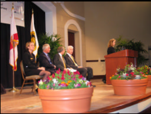
Rosen School Dedication February 5, 2004