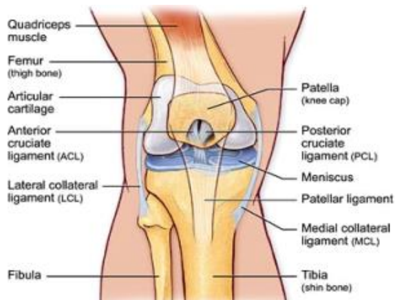
Figure 1-B. What is the MCL? (n.d.). Retrieved February 13, 2018, from http://www.theknee.com/mcl-medial-collateral-ligament/what-is-the-mcl-medial-collateral-ligament/