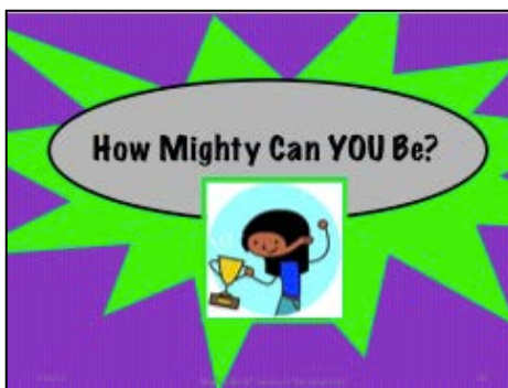
MG Activity Slide for Session 4