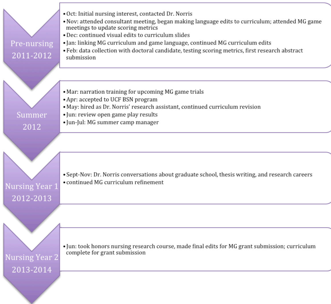
Figure 1: Timeline for Research Experience