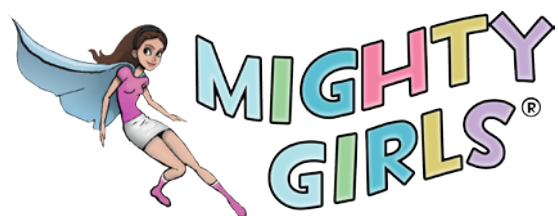
MG Logo designed by E2i Studios, UCF Institute for Simulation and Training