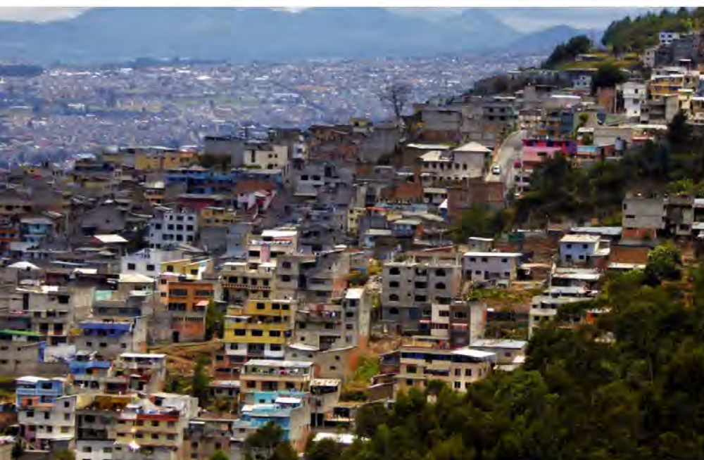
Tourism development in Ecuador is pro-poor; it disproportionately benefits the poorest.

The Ecuadorian government do already plan to spend $660 million over four years to promote Ecuador as a destination and improve infrastructure, so it looks as if the pro-poor phenomenon will continue to play out in Ecuador as Croes and Rivera have so carefully plotted. With the new detailed data in the policy-makers' hands, we can also hope that wealth can now be distributed more evenly across urban and rural communities; this research may pave the way for real social good.