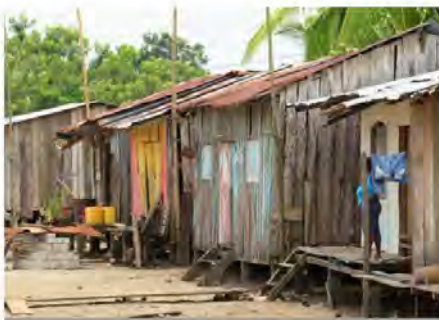
Increased development of rural-based attractions could increase income for the rural poor.