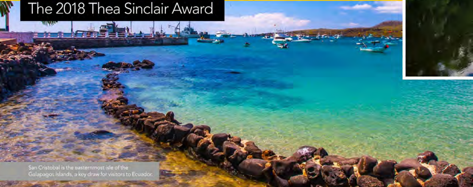
San Cristobal is the easternmost isle of the Galapagos Islands, a key draw for visitors to Ecuador.