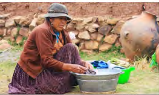
The rural poor benefit the least from increased tourism.