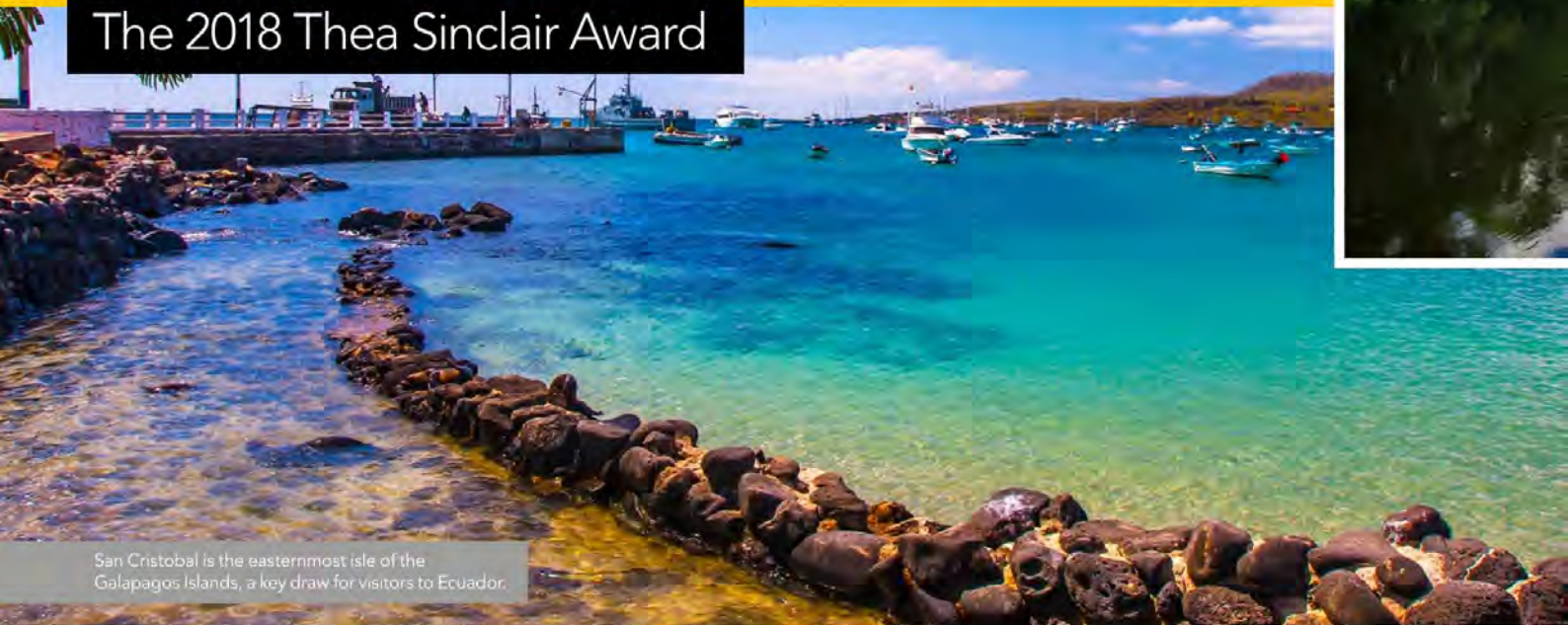
San Cristobal is the easternmost isle of the Galapagos Islands, a key draw for visitors to Ecuador.