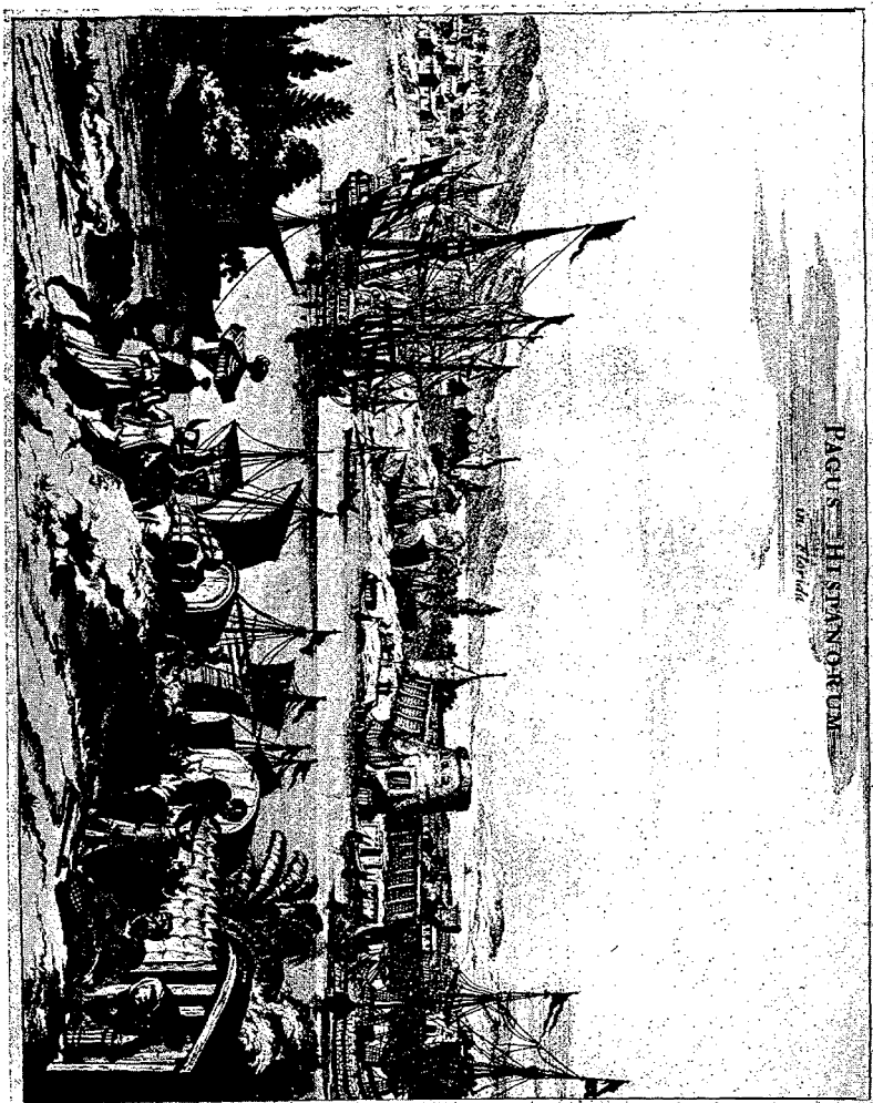
THE MONTANUS MAP, 1671