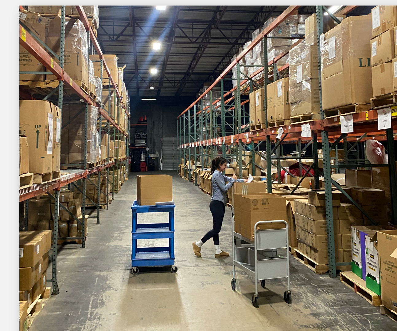
Warehouse located in the back of the store, storing all the supplies and donated items

As students in the Leadership Scholars Academy, we have the opportunity to engage in projects and services that actively benefit our community. By volunteering, working with local organizations, and participating in leadership programs, we are learning how to take responsibility for the well-being of others. Our experiences, such as volunteering with A Gift of Teaching, help us develop the skills to make a meaningful impact while building connections that strengthen our community. Being a part of the academy encourages us to think about how we can contribute to a better society and empowers us to take action, both now and in the future