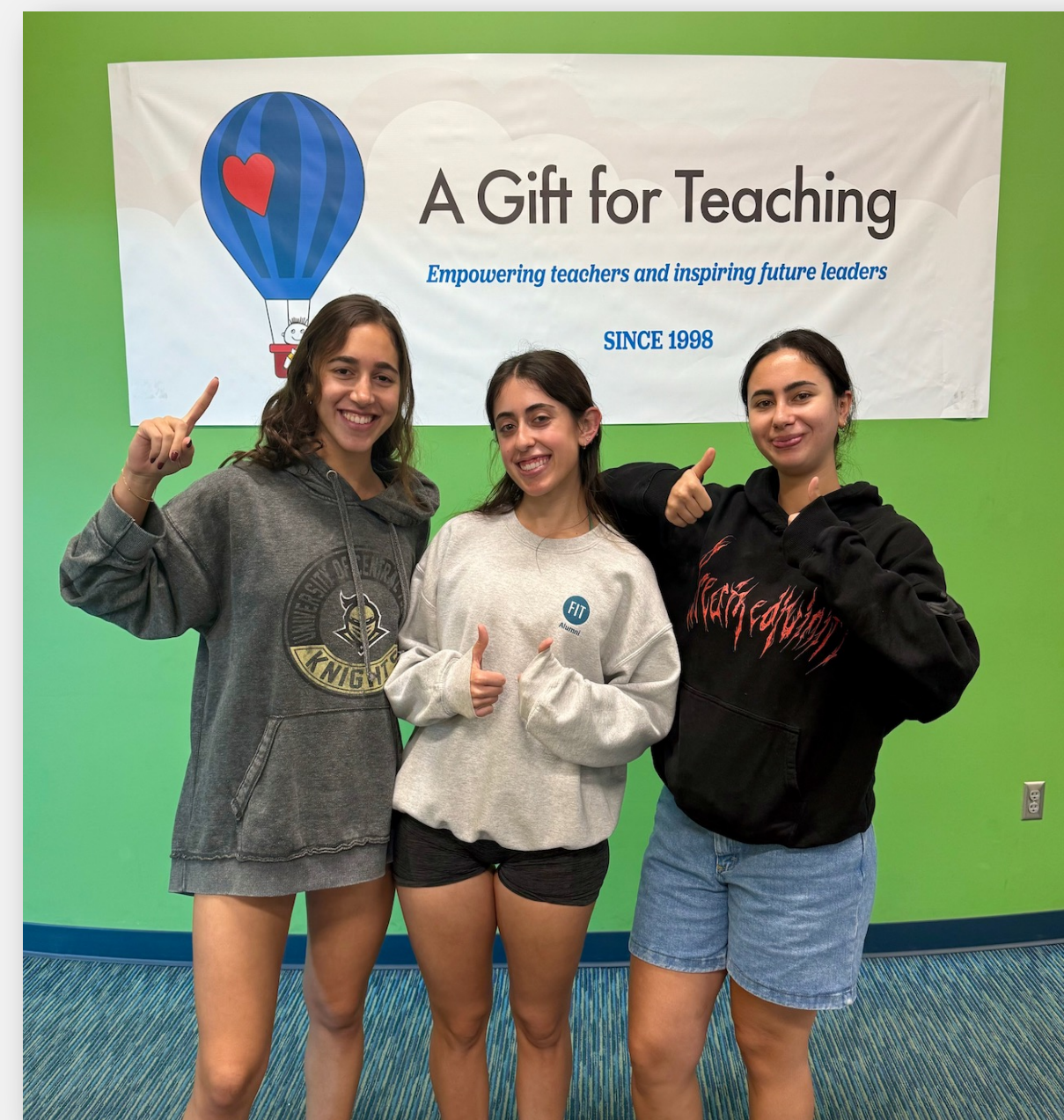
A Gift for Teaching statistics