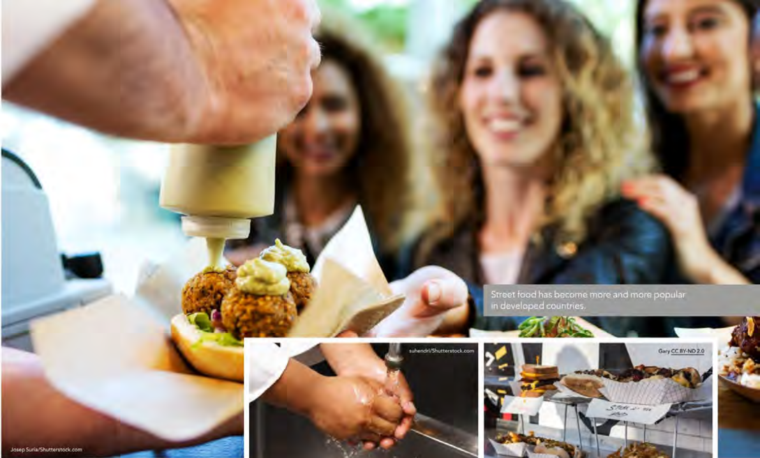
Street food has become more and more popular in developed countries.