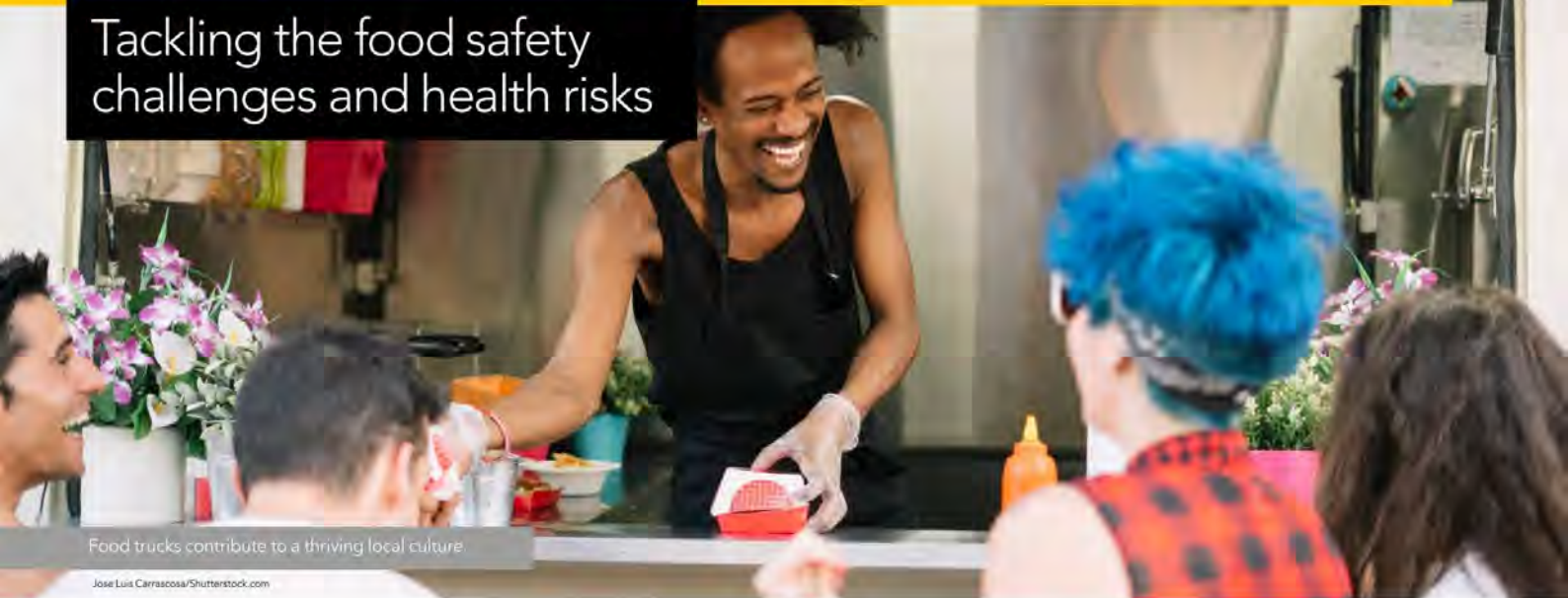
Food trucks contribute to a thriving local culture.