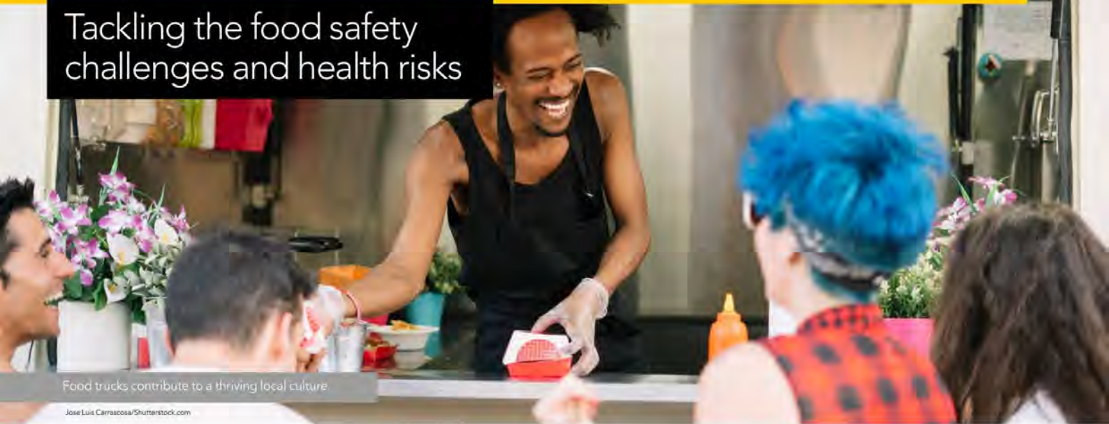
Food trucks contribute to a thriving local culture.