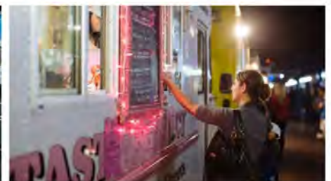
Street food is quick and convenient.