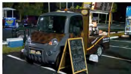
Food trucks provide a wealth of choice.

There are clearly gaps between the food safety regulations and their related inspections.