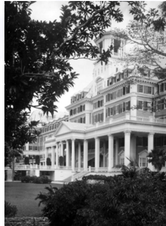
The Royal Poinciana Hotel