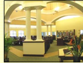
Exhibit Designed by:

Universal Blvd., near International Drive and the heart of central Florida's tourism area. For more information, visit the Universal Orlando Foundation Library's homepage at http://library.ucf.edu/rosen or call 407-903-8100.