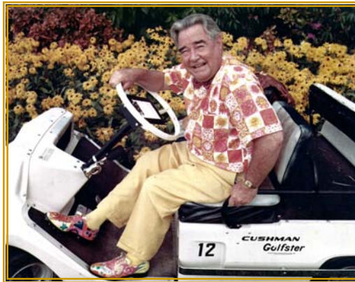
Dick Pope at Cypress Gardens Circa 1970’s.

Pope’s publicity talents helped to build Central Florida into the tourism mecca it is today. Pope utilized the new technologies of photography, and later, film, to capture the beautiful scenery of his park which he sent to newspapers across the nation. Pope called his marketing formula, OPM 2 — ‘Our pictures plus other people’s money squared.’