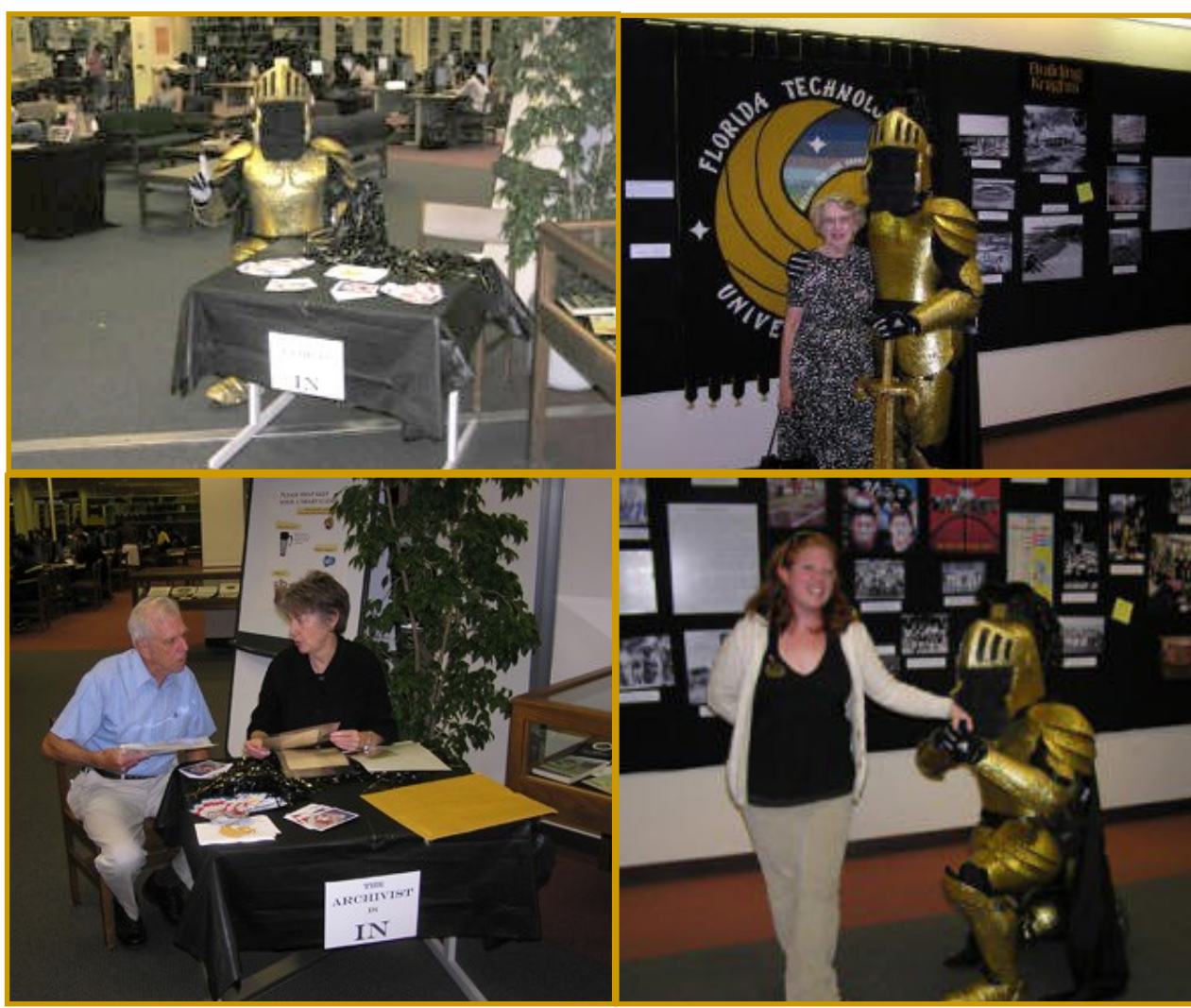
On October 12, the UCF Libraries presented "A Knight Showcase," celebrating National Archives Month and the wonderful exhibit arranged by the University Archives and Special Collections Department. Dozens of guests joined us for the event. UCF mascot Knightro gallantly leant his charisma to the event, dazzling the guests and encouraging other library users to view the exhibit.