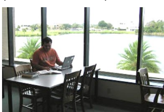
The best seat in the house: a student studies with a view of the BCC/UCF Joint Use Campus' Planetarium across Clear Lake.

The campus is growing at a considerable pace and many area students are choosing to enroll in UCF and attend classes in Cocoa, rather than make the commute to Orlando. As the need arises, additional programs are added to the campus curriculum. Regional campuses intend to offer all the courses necessary to complete specified degrees. For this reason, it is fortuitous that there is considerable growth space in the library for the collection; the need for a building addition should not be a concern for some time.