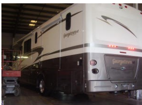
Sample of a Mercedes Homes RV Before

Dale and Media 1 were recently profiled in the September issue of Sign Builder Illustrated, an international trade publication that focuses on trends in the sign industry. Dale shared his expertise on the process of "wrapping" boats in an article entitled "Fishing for Boat Graphics."