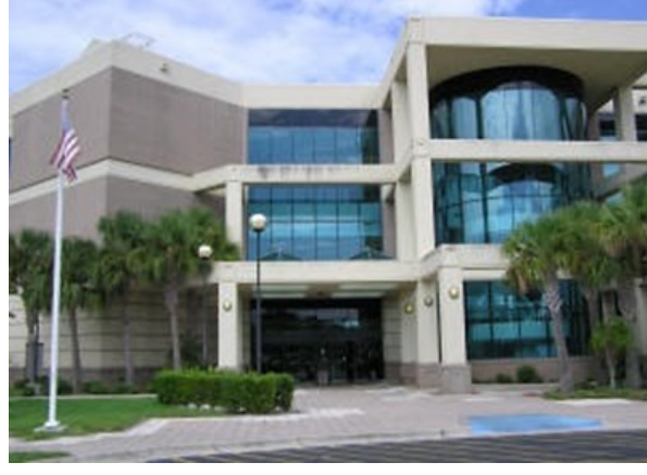
The Front of the BCC/UCF Joint Use Library.

When a UCF Libraries user thinks of available facilities, most everything that comes to mind is housed in the main library building on the Orlando campus. However, by partnering with a number of community colleges, the Regional Campus System provides library services to UCF students throughout Central Florida. This is supported by resource sharing and the cooperative working relationships formed among the librarians. Their integrated teamwork allows them to offer enhanced services to faculty and students at both institutions. One excellent facility that figures highly in the list of UCF Libraries' assets is located in UCF's Southern Region on the Cocoa campus.