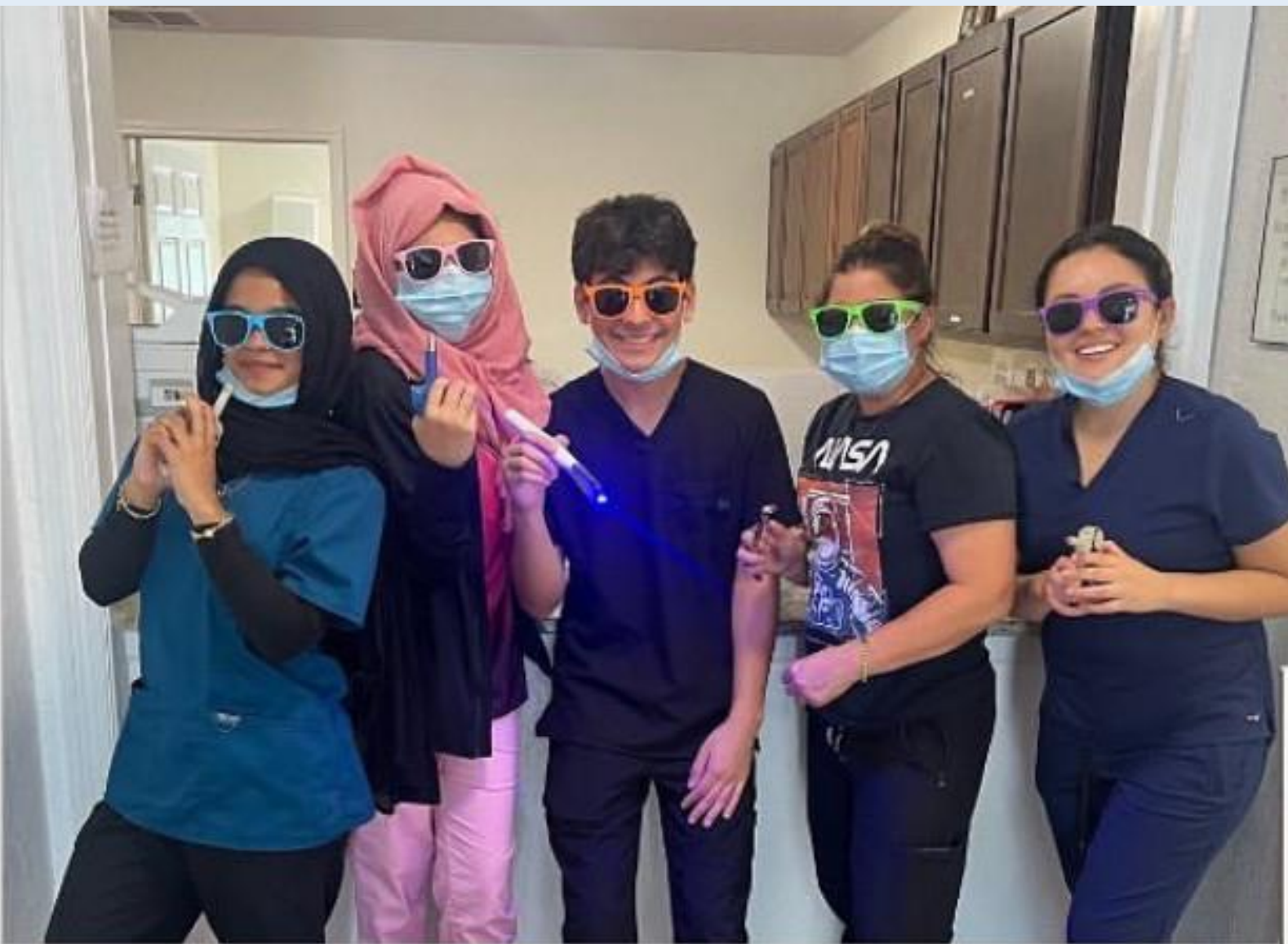
Caption: AMCC Dental Team (Clinical Day)

After my experience volunteering with AMCC, I have gained an understanding of the health disparities within my community and how certain socioeconomic factors, such as insurance, income, education, and employment, can determine their accessibility to a dental health professional. Due to these socioeconomic factors many patients have been hindered to dental access for years up to decades. With this realization was clear to me my civic responsibility I need to take ownership of is to impact the community to the best of my ability in the dental setting. Interacting with patients has helped me understand their situation and realize how privileged I am to have dental insurance and relatively no economic hardships. Furthermore, building my communication skills has helped me become more empathetic toward the patients and be respectful of their emotions and the difficulties they have been experiencing up to this point. I have learned that no matter their background or circumstance we are here to be them and send pain free with zero cost.