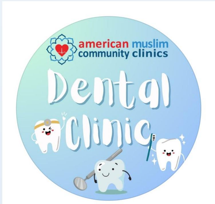
Caption: Instagram Logo for AMCC Dental Clinic Volunteers

During my volunteer service this fall semester, I spent some time training the new volunteer dental assistants and helping them become accustomed to the x-ray room, sterilization area, and where to find the instruments for the dental providers. Training new dental assistants, typically pre-dental students, showed me the importance of leading by example and showing them patience and the responsibility of being a volunteer dental assistant at AMCC. I have become more aware and committed to my position through these responsibilities. These experiences will lead me to realize the civil responsibility Dental Professionals and assistants have to impact their community significantly especially in oral health access.