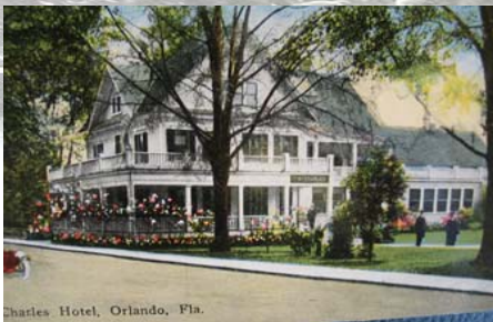
Charles Hotel, Orlando, Fla.

Orlando in the 1880's was a raw town with lots of dirt streets. Emerging as Florida's largest inland city once the railroads provided access, the town rapidly attracted visitors who came for business and for pleasure— all in need of lodging.