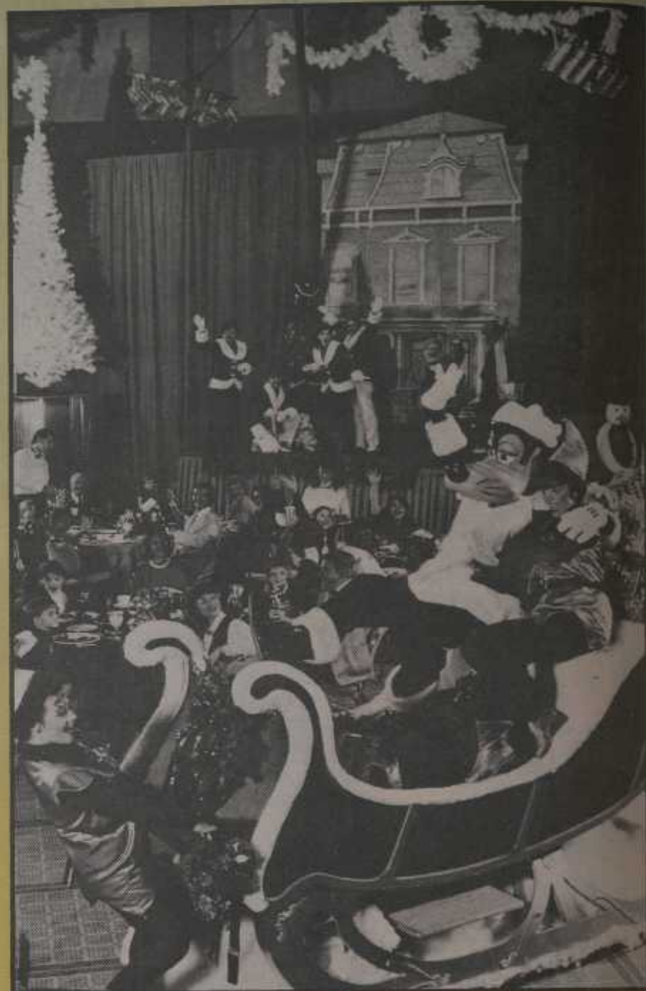
Disney gets ready for the Holiday season, in classic Disney style. And look, there's the big Goofy himself!

The LYNX BROADWAY SERIES will present JOSEPH AND THE AMAZING TECHNICOLOR DREAMCOAT for eight performances Tuesday-Saturday evening at 8:00 p.m. with matinees Thursday, Saturday and Sunday at 2:00 p.m. Tickets ($26.50- 45.00) are on sale now at the Broadway Series Box Office, the Orlando Arena and all Ticketmaster Ticket Centers including Gayfers, Sports Unlimited, Blockbuster Music, Spec's, and select Blockbuster Video, or Charge-By-Phone by calling (407) 839-3900 or (904) 353-3309.