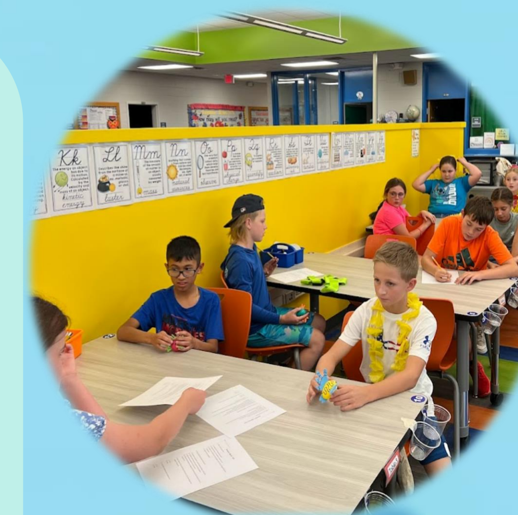
Some of the students completing their post-tests

Additionally, by creating a memorable experience for them, as well as providing them with fun, take-home items, like the lionfish eggs, coloring sheet, and Hawaiian leis, we also impacted the friends and family with whom they would go home and share with their experience.