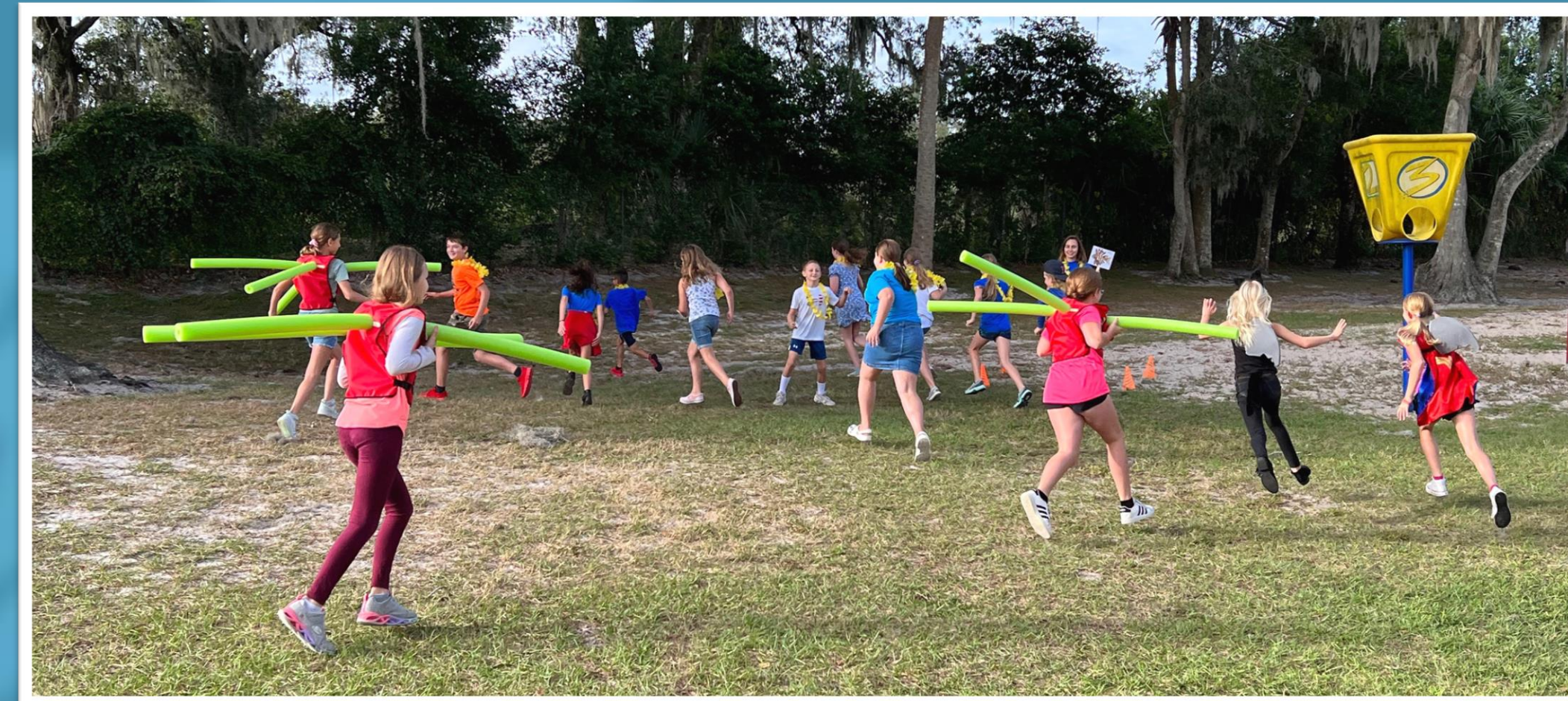
The class participating in our outdoor lionfish/shark predation game