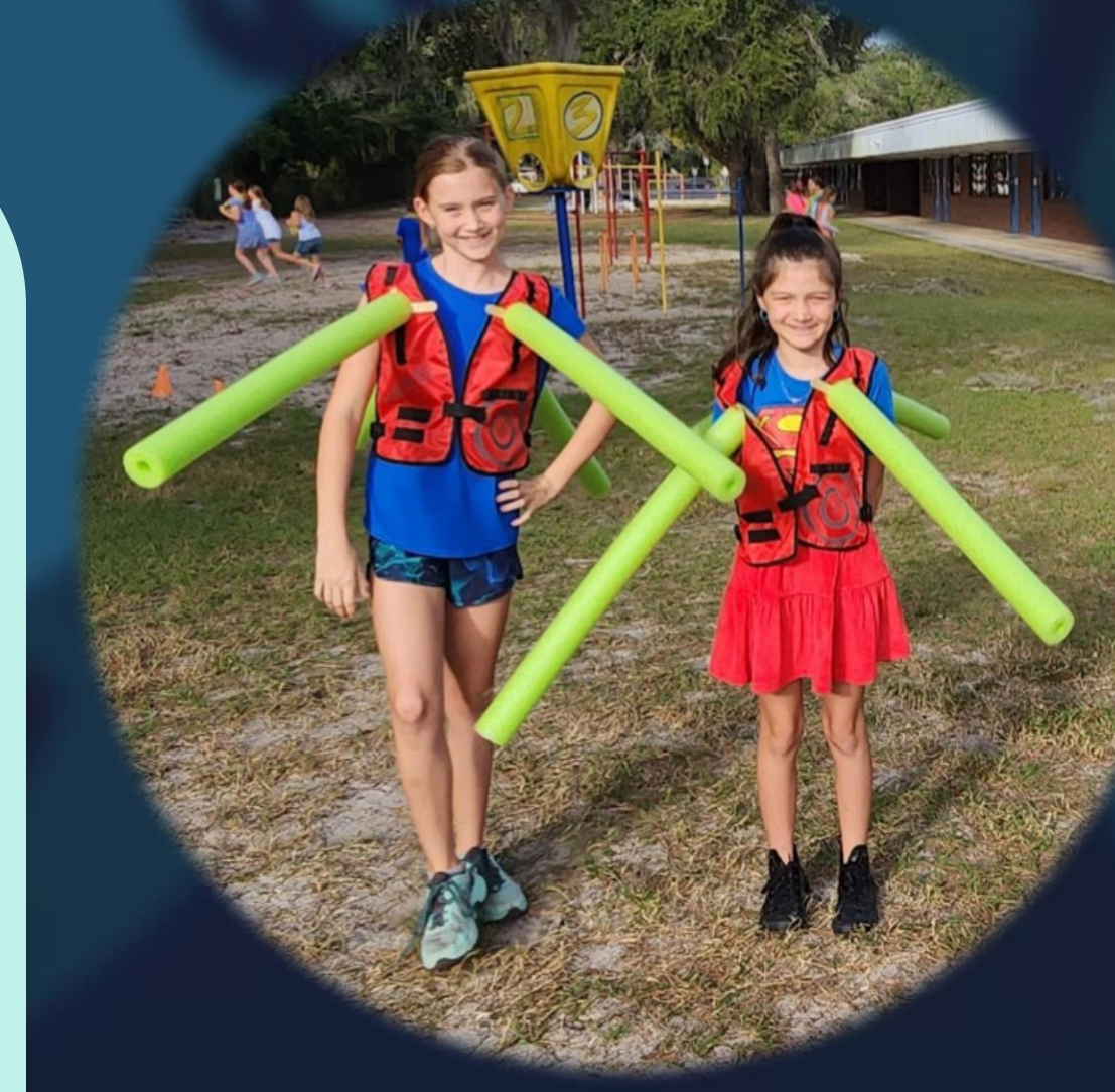
Two students smiling and wearing the lionfish vests used for our outdoor game