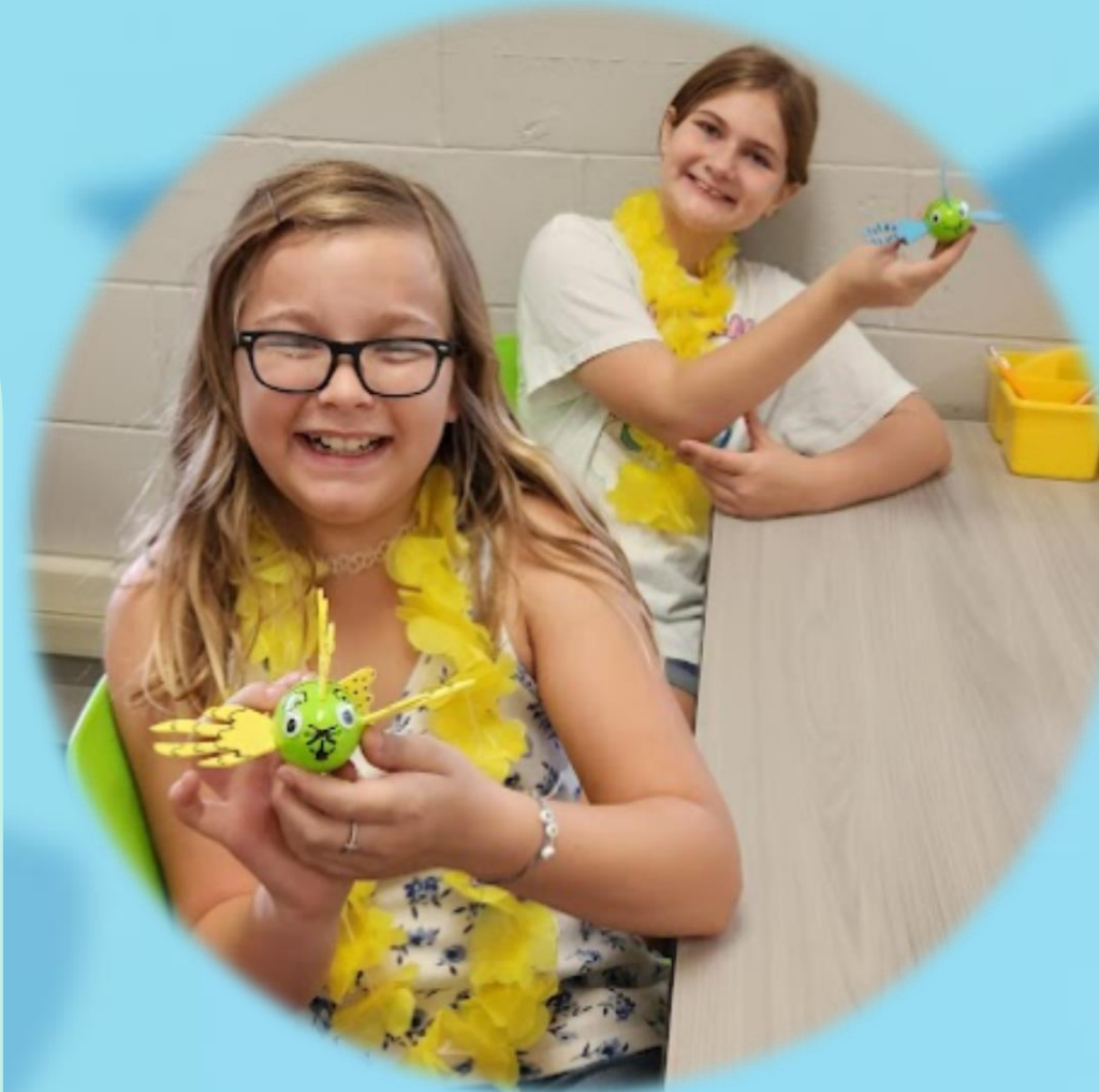
Two students smiling with their take-home lionfish crafts

Our aim with this project was to educate elementary students about marine invasive species in an entertaining way. We were able to directly impact fifteen students with our project.