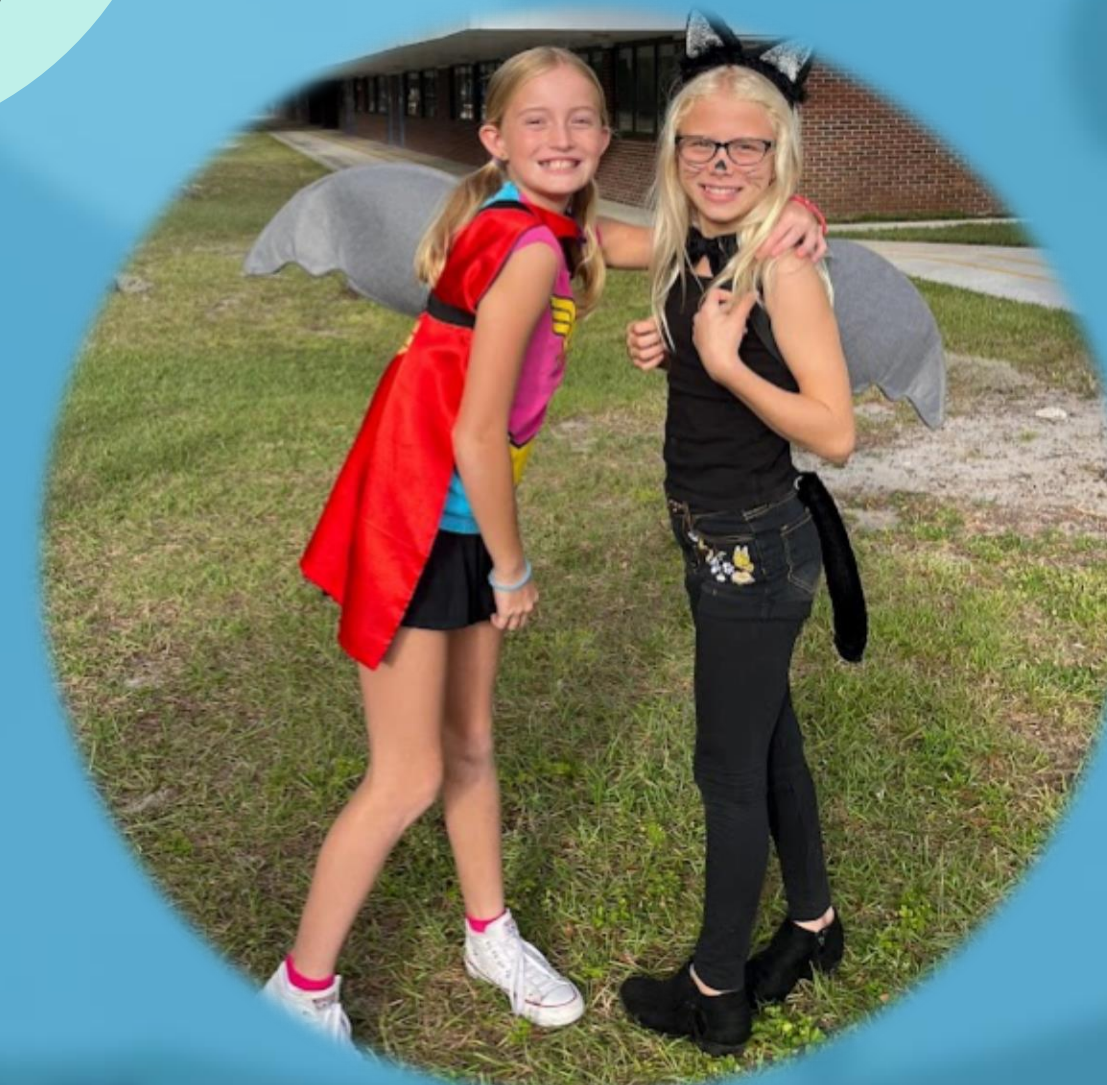
Two students smiling and wearing the shark fins used for our outdoor lionfish/shark predation game