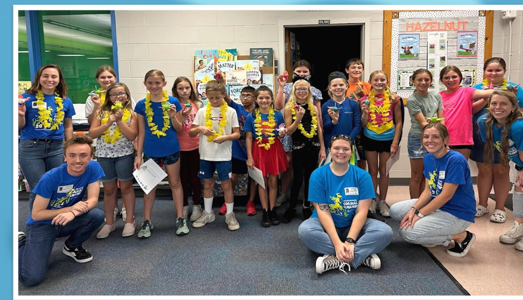
The fifteen fifth-grade students and our team