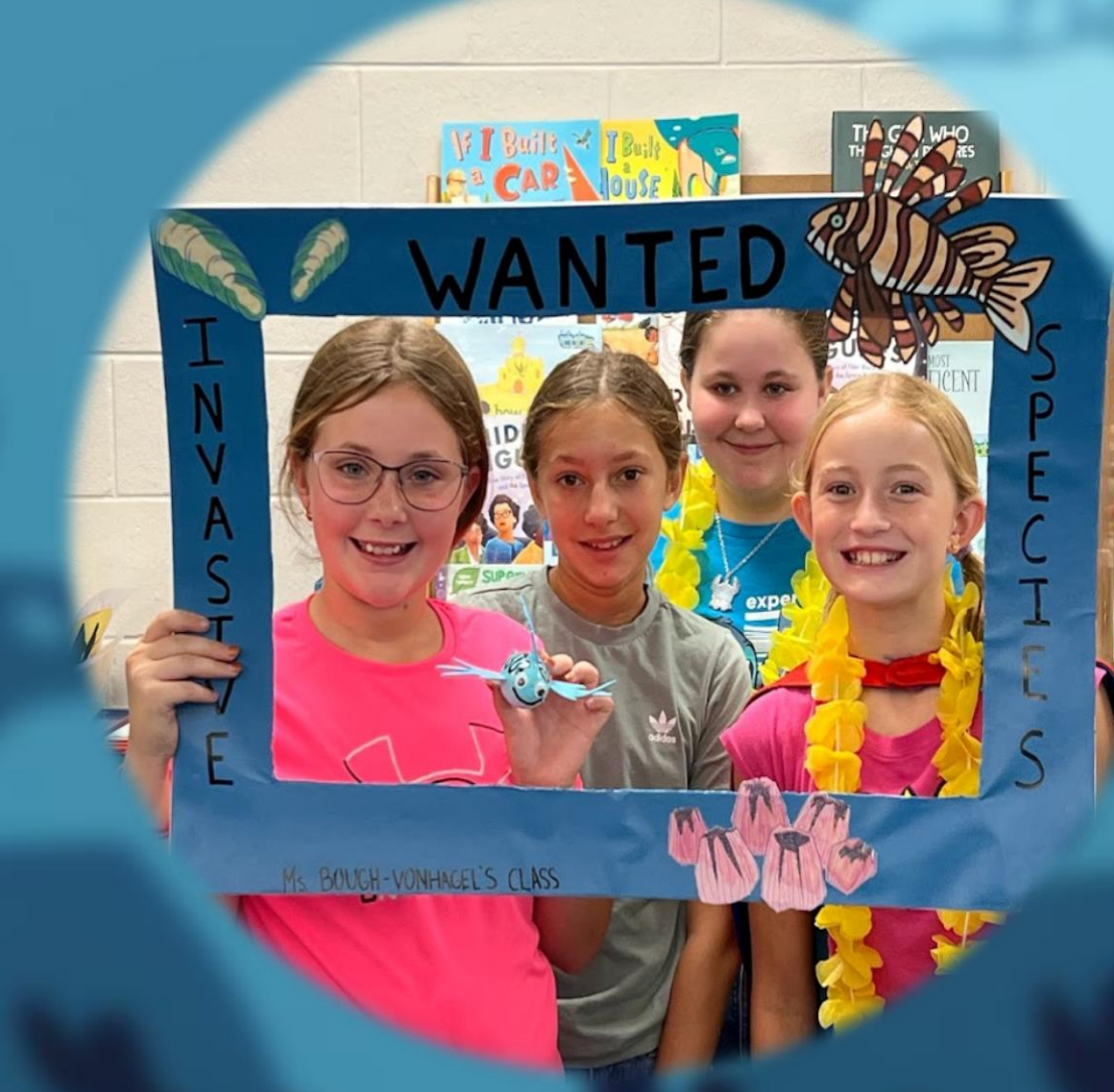
Four students posing with the invasive species photo frame with their take-home lionfish item