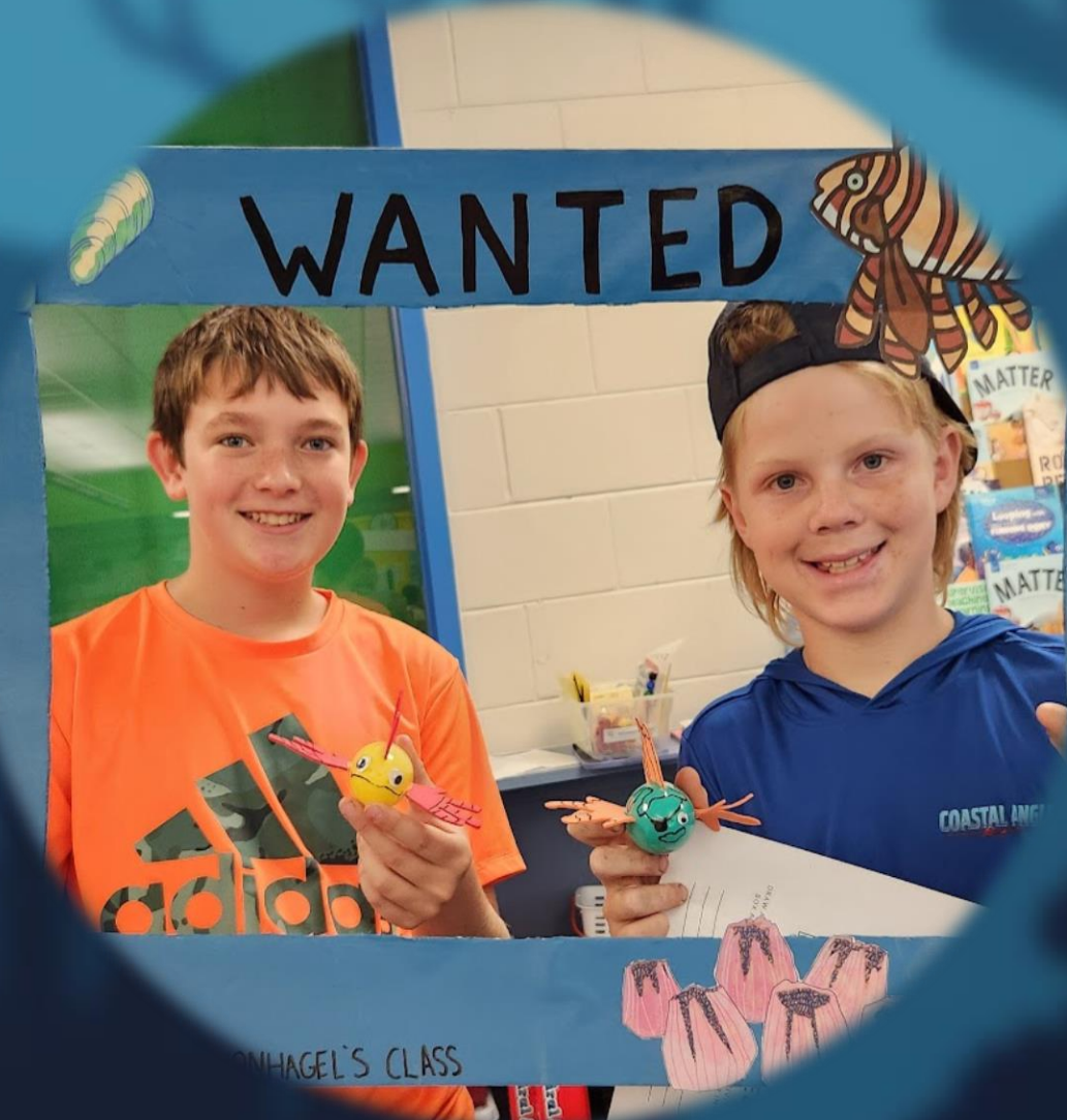
Two students posing in the invasive species photo frame with their take-home lionfish crafts

The goal of this class was to not only learn about marine conservation and restoration but also to better our science communication skills and impact our community through service learning. Our classroom visit encompassed all of this, as it was a great opportunity to inspire the future generation, who can make a difference in conservation efforts. We practiced communicating scientific ideas in class by presenting to our classmates and participating in UCF STEM Day, which helped familiarize us with the grade level we taught. Additionally, a topic we discussed in class is how humans are the cause of species invasions the majority of the time. In the case of the invasive species we highlighted, all of them were transported by humans, either through a ship's ballast water, hitchhiking on a ship's hull, or through the aquarium trade.