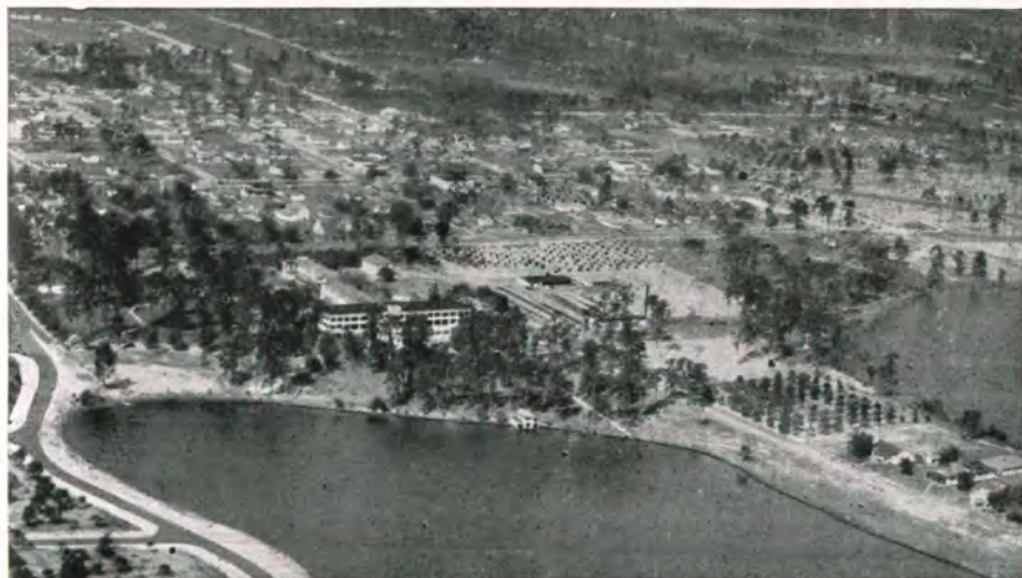
THE VISITOR IS ALWAYS WELCOME TO THE BEAUTIFUL GROUNDS OF THE FLORIDA SANITARIUM AND HOSPITAL

It isn't hard to determine the reason why Perrydell guests linger for just "a little while longer". There is something always to attract the eye. While being served with delicious food you take in the bits of artwork, tapestries and antiques in profusion throughout the rooms. The beautiful landscape scenery visible through the open windows and the excellent service are inviting. Just little details such as a rosette from the Perrydell gardens in every fingerbowl make this the outstanding tea house and gift shop in the state. Visit the Perrydell today—you will go more often, we know.