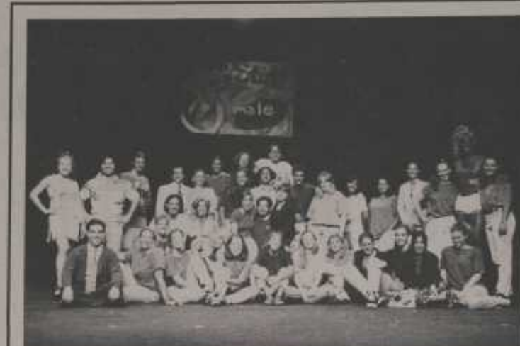
The cast of Bits 'n' Pieces poses for a picture.

I have come to expect more from Rollins each year because I have devoted my time, money, and effort to this college. I have grown as an individual and as a student here and I am proud to be a part of this community; however, last night's performance left a bitter taste in my mouth and made me realize that, perhaps, others are not as proud of this college as I am. I find it hard to believe that this show would have been permitted to take place had you known what was going to occur in the second performance of Bits and Pieces. I am shocked to imagine what the incoming freshmen must think of this college if they witnessed this performance. Poking fun at Rollins is one thing, but complete disrespect for the people who comprise and lead this