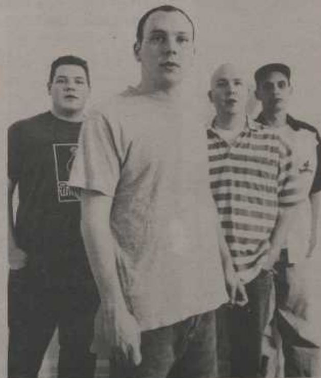
The Smoking Popes burst into the music scene with their debut album Born to Quit .

just a bunch of regular young guys aggressively looking for love and understanding.