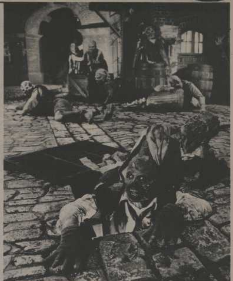
Monsters are emerging, ready to spook the masses for Halloween Horror Nights at Universal Studios held on October 13-14, 19-21, 25-31.

In "Terror Underground," new for '95, a host of demonic tunnel dwellers await unsuspecting victims as they travel through a sinister labyrinth of subway tunnels filled with spooks and ghouls located in the deserted confines of Universal's New York backlot. In Universal Studios Florida's newest addition, "Universal's House of Horror," guests will be immersed in the eerie sights and sounds of Universal's classic horror films, experiencing the