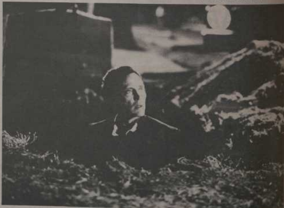
Christopher Walken stars as Gabriel in Gregory Widen's The Prophecy

The Prophecy reminds me of the typical B-movie, but not as low of a budget B-movie. It is a boring flick with blood and religion mixed. The angels aren't portrayed as your traditional