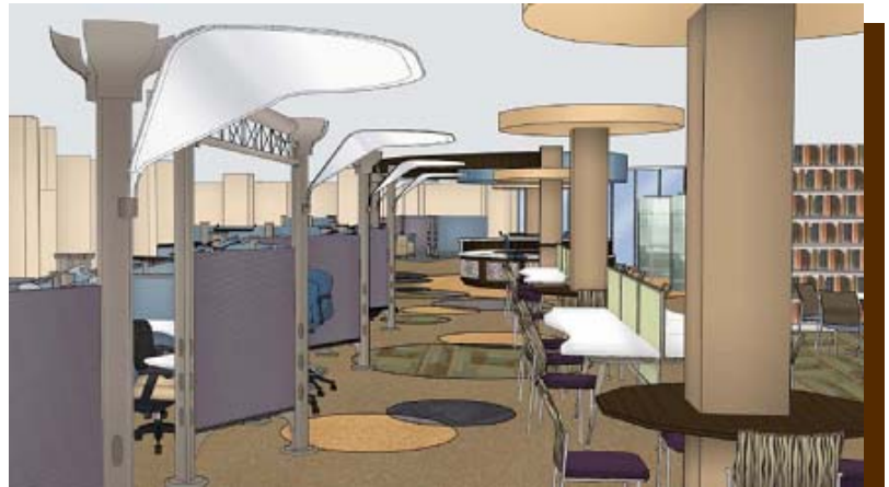
Fall 2010: University Libraries Knowledge Commons

More information: http://library.ucf.edu/newlook