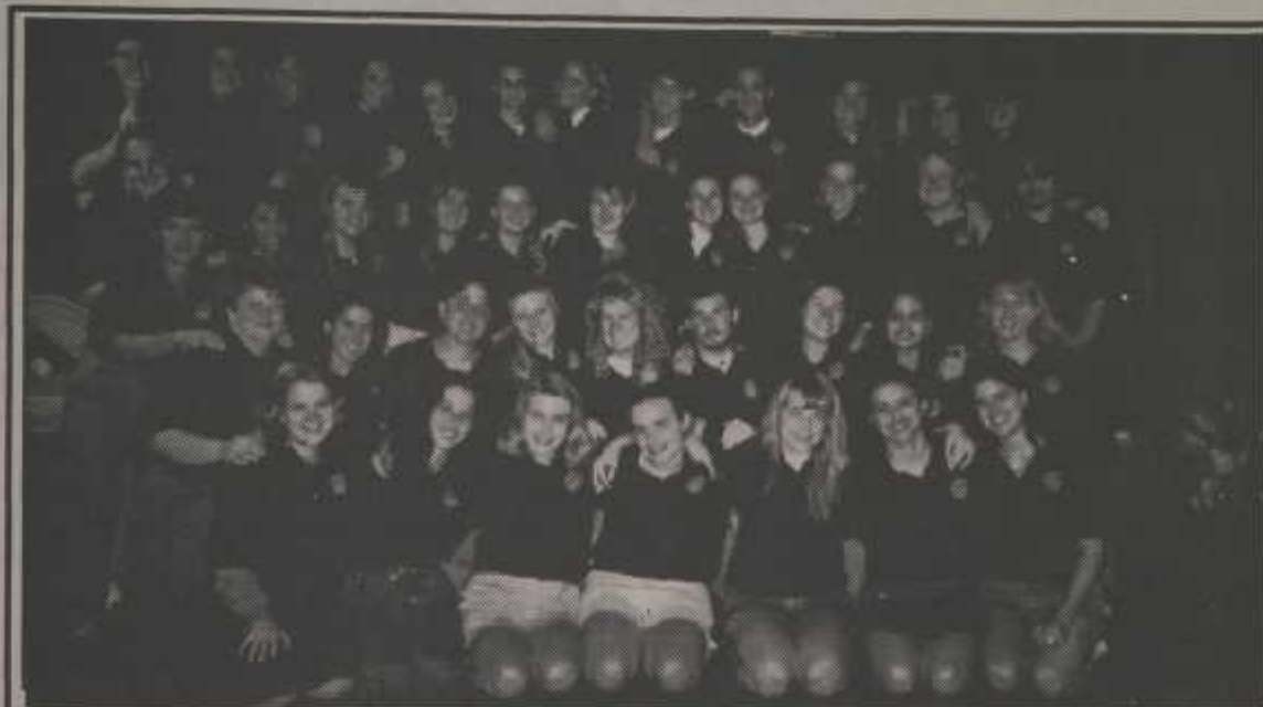
Rollins Student Ambassadors gather for a monthly meeting in the Down Under to discuss the upcoming events for November.