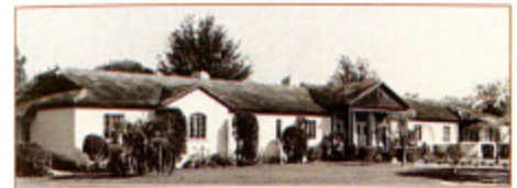
Lutheran Haven was built in 1949 on land adjacent to the church.

resulting design was a church—capable of seating more than 400 people—in the shape of a cross. The worship services were now transmitted via live radio broadcasts, and the congregation and school continued to grow.