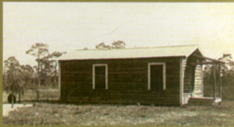
The first church stood in what is now the cemetery near the intersection of SR426 and Chapman Road. The building was recently returned to this site, pending restoration.

Their first church was created using abandoned turpentine shacks. The congregation numbered just 25 baptized souls in 1912.