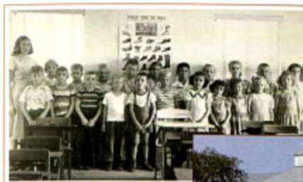
The old wooden church building was converted to a one-room schoolhouse in 1947.

The education of the children was of utmost importance to the congregation. In 1947, the old wooden church building was moved behind the new church and converted into a one-room schoolhouse, which served their needs until they could erect a new school (K-8) in 1949.