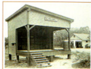
Slavia train depot. The "General Store" in the background still stands today.