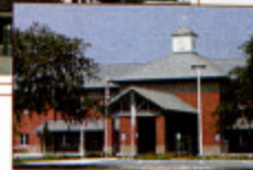
The new two-story school opened in 2000.

With several additions, the 1949 building served until the erection of a new, two-story structure in 2000, which accommodates more than 650 students.