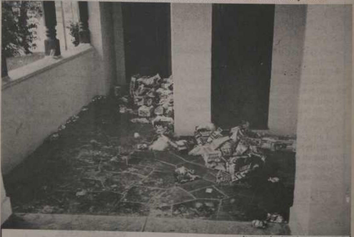
Just some of the mess left by partying TKE's.

is, why not tell all interested students that partying takes precedence here and not actual learning? Finally Rollins could cast off the disguise of being a college and become the country club it has always been.