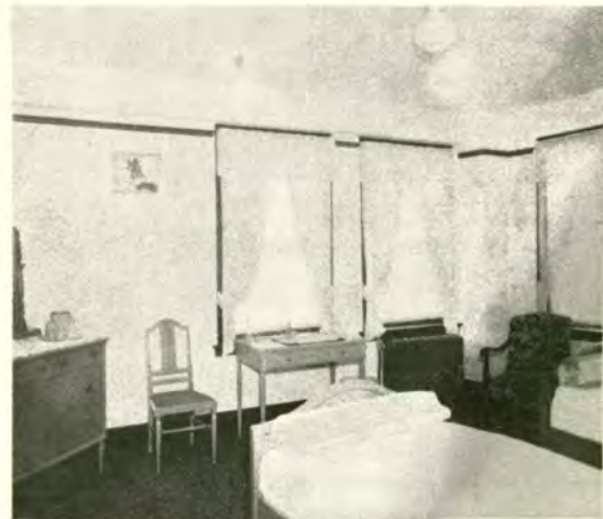
ONE OF THE GUEST ROOMS

The top of the hotel is a little over 300 feet above sea level, or slightly less than Iron Mountain, 2 miles away, recognized by the U. S. Geological Survey as the highest point in Florida.