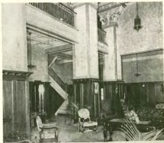
PARTIAL VIEW OF THE LOBBY

Dixie-Walesbilt has every convenience and luxury for the comfort and pleasure of the guest. It contains 100 Guest rooms, with bath, Dining Room, Grill Room, Ball and private Dining Room, Lounge, Lobby, Laundry, Mezzanine promenade and Observation Floor. It has a frontage of 178 feet on First Street, with a depth of 125 feet on Park and Stuart Avenues. A splendid array of retail shops of various descriptions for the convenience of the guests are located on the ground floor fronting First Street.