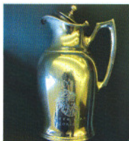
Silver tea pot from the Seminole Hotel, Winter Park

The display of artifacts—in many cases, all of which remain to tell the story of some of the grandest hotels in Orlando's history—celebrates not only the grandeur of the facades, but also the birth of professional inn keeping and the impeccable service and hospitality for which the city is renowned today.