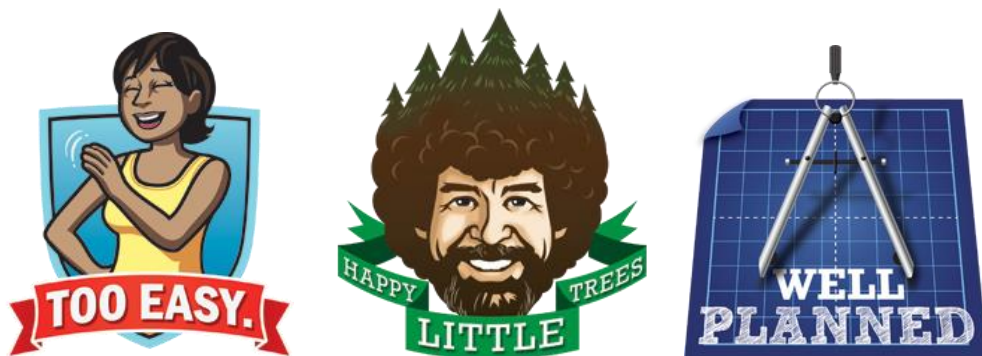
Fig 1. Badge Examples

Badges were introduced by the “Let’s Play a Game” badge, which was awarded to all students on the first day of class. Subtext accompanying the badge indicated that many other badges were obtainable, but that students would not be told how to unlock them. In accordance with Blair (2012), aside from one introductory badge, all badges were skill-based, requiring the demonstration of advanced ability or exceptional effort to obtain the badges. While some were awarded for achieving a perfect score, others were given for reasons such as performing well and submitting an assignment early, demonstrating exceptional creativity, or helping another student on the discussion board. Examples of badge designs are included in Figure 1.