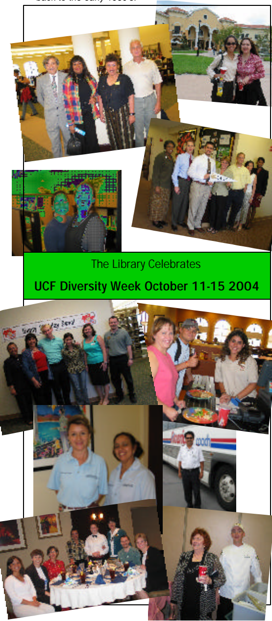
The Library Celebrates UCF Diversity Week October 11-15 2004