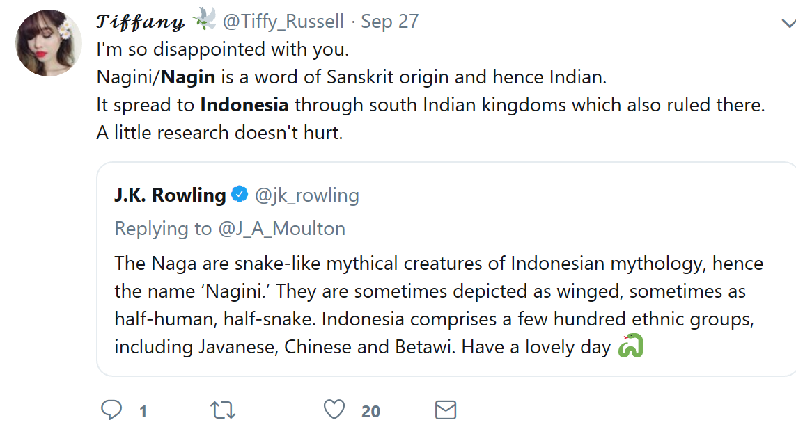
Figure 2: Example of Disagreement with Mythology