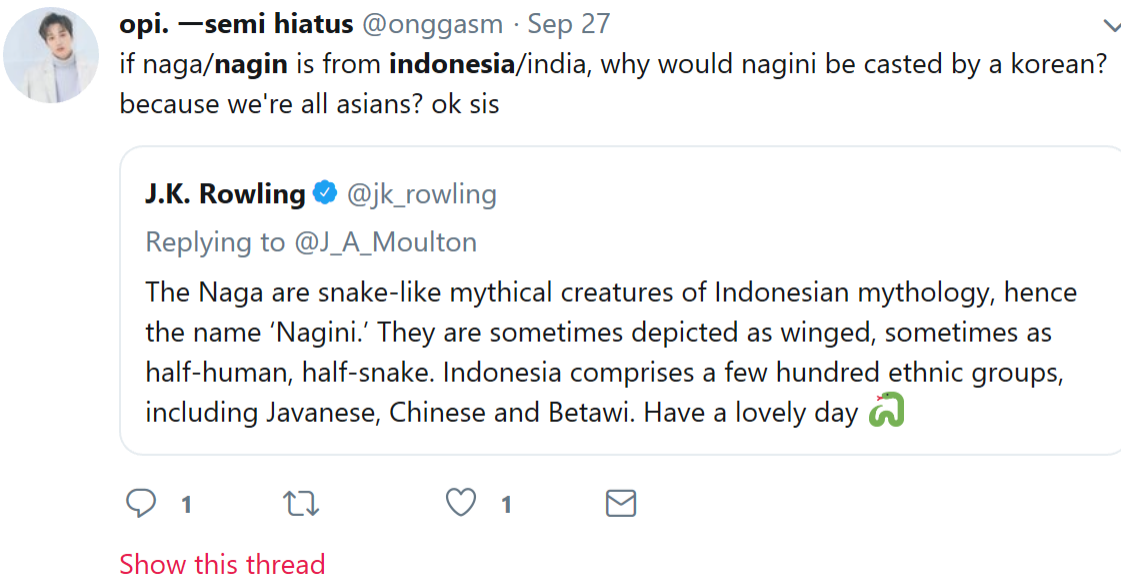
Figure 1: Example of Disagreement with Casting

The object of criticism is defined differently depending on whose reaction one analyzes. First, some claimed that the casting of Claudia Kim, a Korean actress, misaligned with the Indonesian mythology Rowling employed (Figure 1). Second, some claimed that the Indonesian mythology originated some hundreds of years earlier in India, and traveled to Indonesia via domestic trade, and therefore is inaccurate in some way (Figure 2). And finally, some voices expressed overall dissatisfaction with the depiction of the character for a variety of reasons, ranging from her clothes to her overall role in the universe (Figure 3).