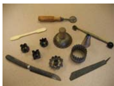
Various cutting & edging tools