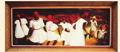
Top: Untitled by L'Ouveture Poisson; oil on canvas, 1968.