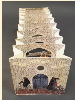
The Tunnel Calamity by