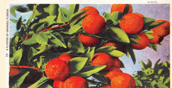
171 A CLUSTER OF ORANGES, FLORIDA

"An accurate map of the West Indies" by Emanuel Bowen was originally published in The Gentleman's Magazine in 1740. This map was created for 'the curious as well as students' in showing the features of the West Indies.