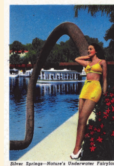
Silver Springs—Nature's Underwater Fairyland