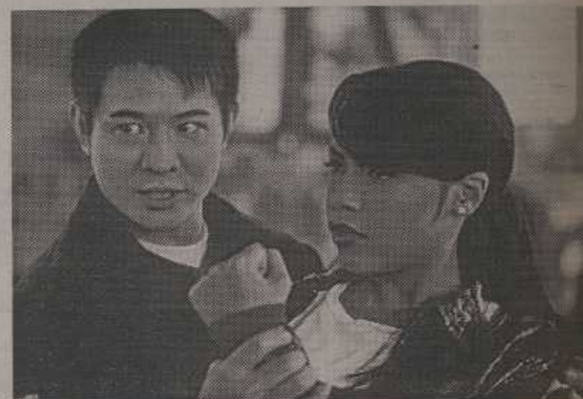
Jet Li and Aaliyah in Warner Brother's Romeo Must Die , 2000