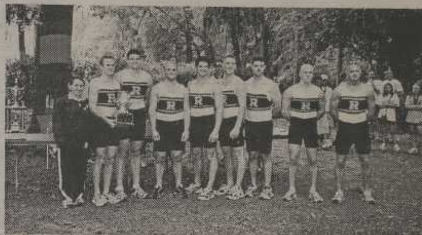
Athletes of the Week, Men's Varsity Eight

The team improved their time from the previous week by nearly