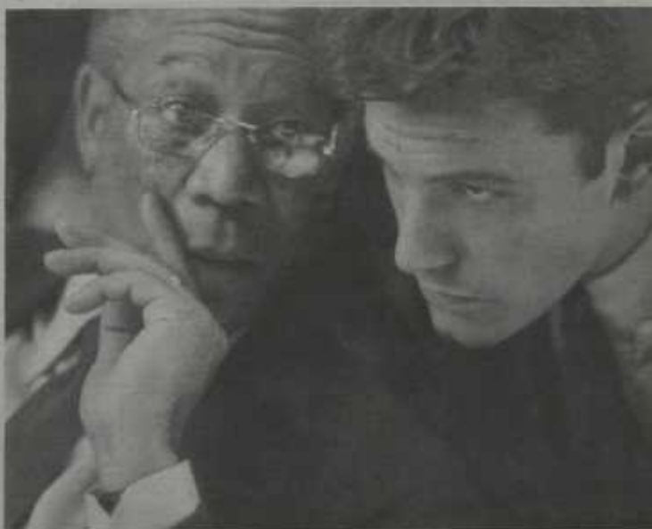
(Left to right) Morgan Freeman as Bill Cabot and Ben Affleck as Jack Ryan in "The Sum of All Fears". This film has been rated PG-13 by the Motion Picture Association of America for violence, disaster images and brief strong language.