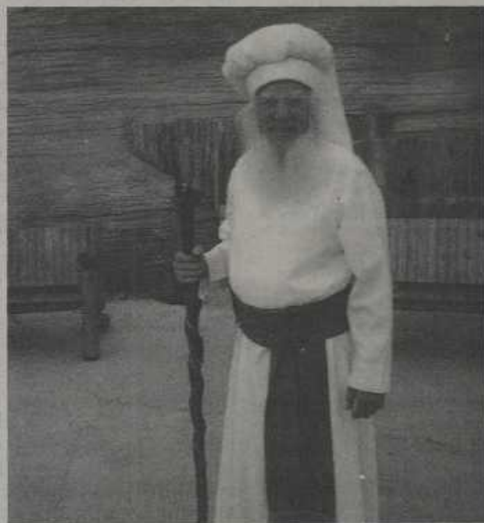
The Sandspur goes to the Holy Land. Story on page 2.

We are lucky to have elected officials in these positions, who are dedicated and sympathetic to the needs of people they represent. Next year is looking to be a very productive one in terms of making Rollins a place where students and faculty get along better.