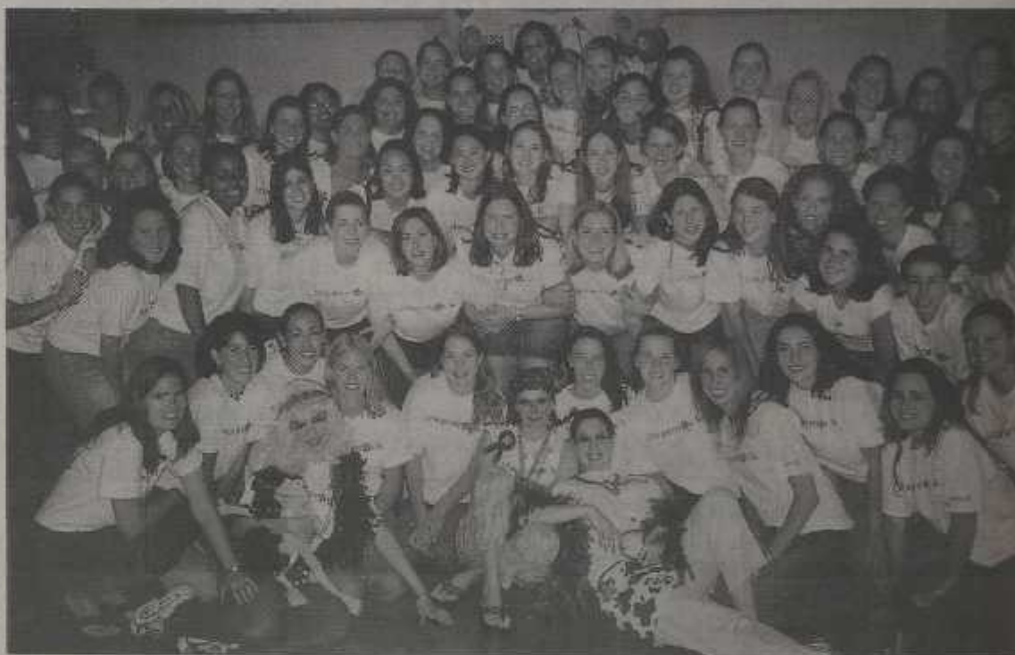
Have a Happy Summer! Thank you for all your support. Best wishes, Kappa Delta Sisters