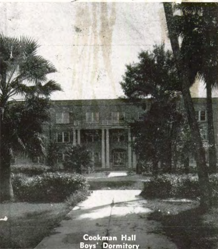
Cookman Hall Boys' Dormitory