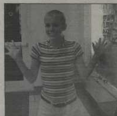
"I'm going to be Tinkerbell! Look for me!"