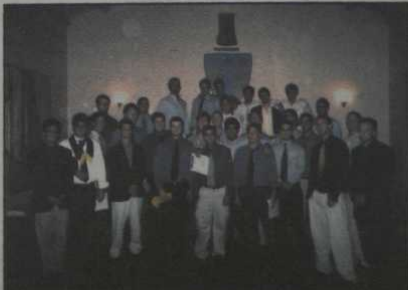
ALPHA TAU OMEGA: Our chapter makes a name for itself by receiving the "True Merit Honorable Mention Award."