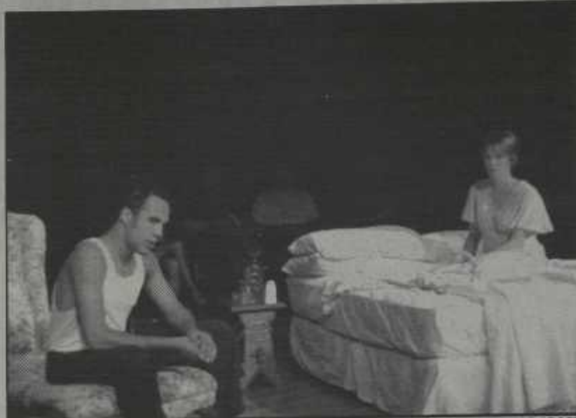
ANOTHER THEATRICAL HIT: Blue Room will make you think beyond your daily problems into another perspective.

In the end, there is a full circle feeling as the same girl from the beginning of the show chooses honesty