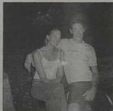
"We don't know... but we're going to the Sex Emporium for ideas."