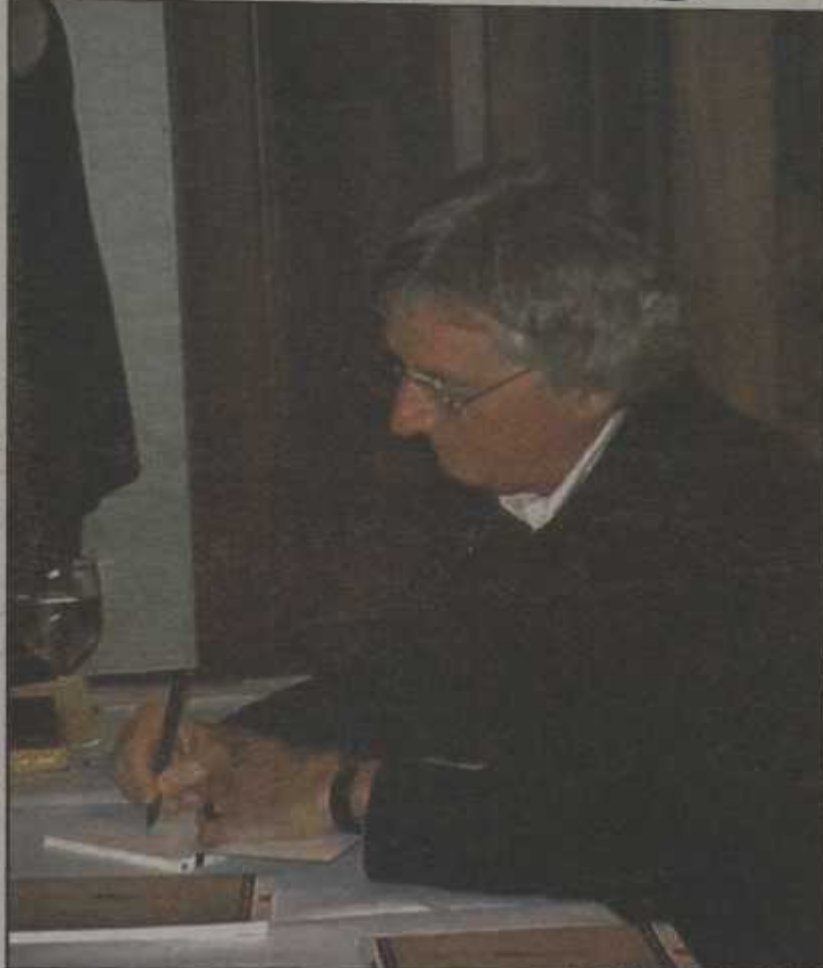
CHARLES WRIGHT: Pulitzer Prize winning poet signed his books after his well received reading in the Bush Auditorium.

■ Award winning poet shares his poetry and knowledge.