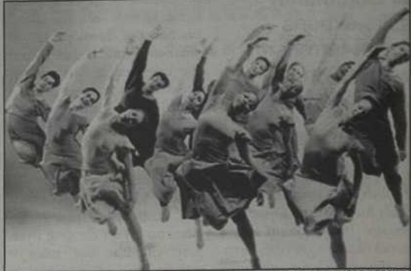
Coordinated Body Movements: Here the dance crew performs as a team of coordinated, limber, spirited dancers.

The third performance, Transfiguration , was very, very interesting and of a debatable message. Basically, the performance took place almost entirely on the floor. The spotlight began focused on the resting body of a woman. She constantly coiled, writhed, and moved almost in painful motions. The light emphasized her strong, limber body that shot up in painful thoughts. To me, the performance represented a