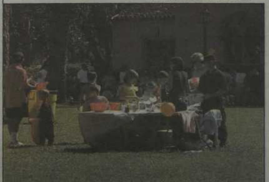
HALLOWEEN HOWL: Rollins students volunteered their time to run the activities during the community event.