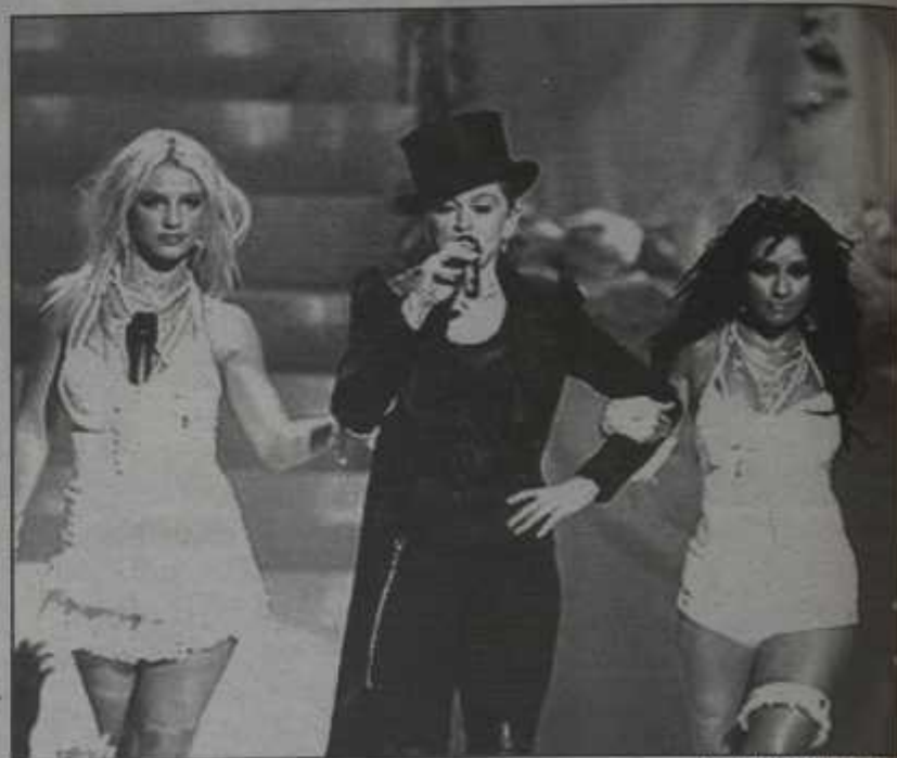
THREE'S COMPANY: Diva Madonna shares more than just the stage with her younger pop proteges.

ence, and throngs of scantily clad female dancers accompanied her. Her outfit bordered on bizarre, a gold bikini top and shorts duo, with what looked like a giant bow tie in the center of her top. Later, she shimmied around Jay-Z with a giant fur stole, which seemed out of place. Rumors of the Beyoncé and Jay-Z's romance were only fueled by Beyoncé's ambiguous "thank you" to Jay-Z in her acceptance speech.