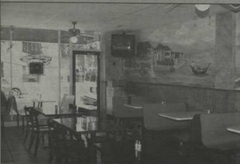
PIZZA TIME: The local Park Avenue Pizzeria is a great place for good times and food.