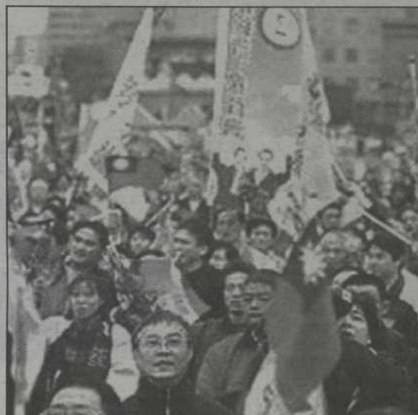
A CONTROVERSIAL ELECTION: Thousands of constituents rallied to protest the narrow victory of Chen Shui-bian.

The poll deadlock and political uncertainty is expected to continue until the high court makes a decision as to whether a recount is necessary.