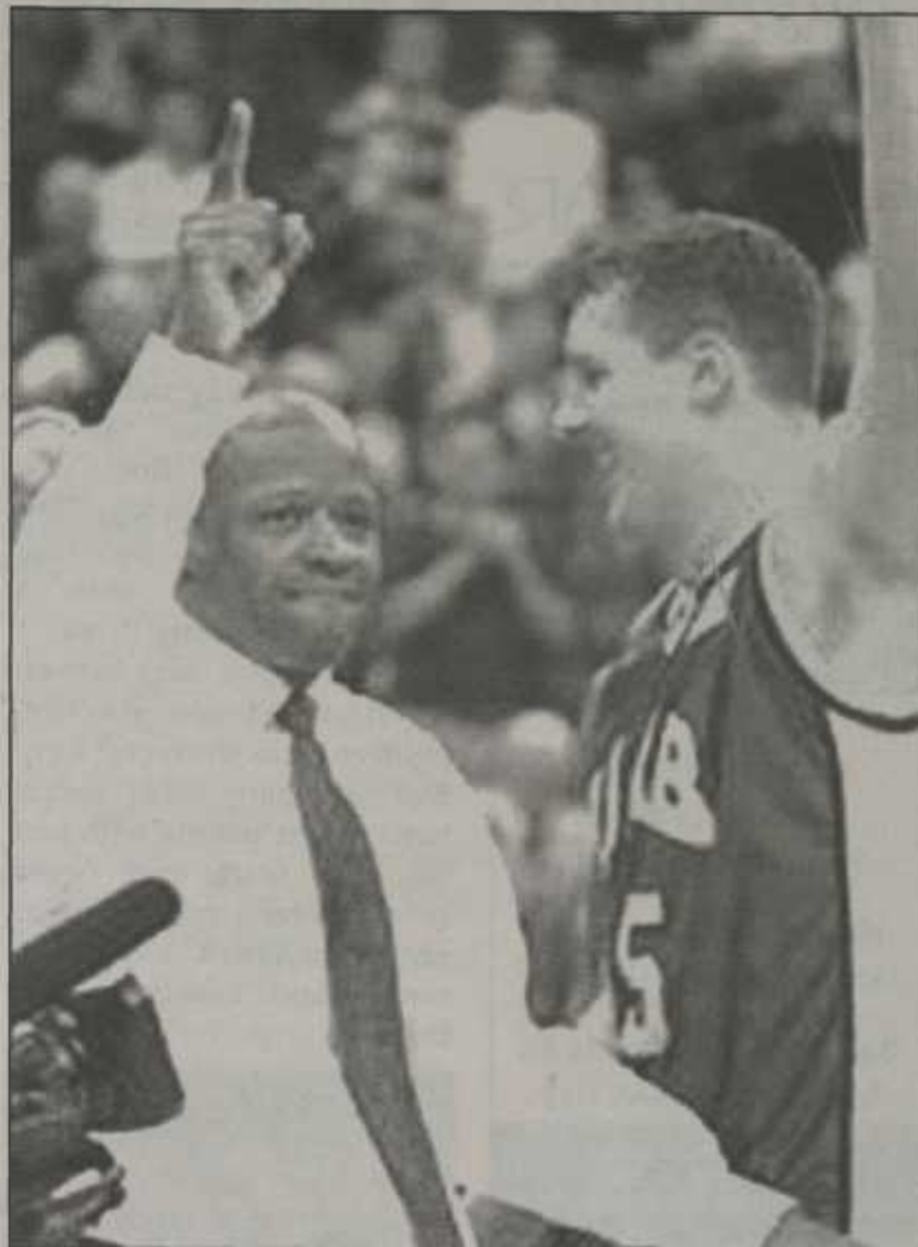
UPSETS EVERYWHERE: UAB Head Coach and Players celebrate their colossal upset against Kentucky.

The rest of tournament will be as followed: Regional Sweet Sixteen and Elite Eight games will be played out this Thursday through Sunday in St. Louis, East Rutherford, Phoenix and Atlanta respectfully. Semifinal Final Four games are scheduled for the next Saturday with the National Championship to be held Monday, April 5 in San Antonio.