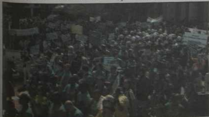
RALLYING FOR EDUCATION: Students and educators gathered in front of the Capitol to protest proposed education cuts.