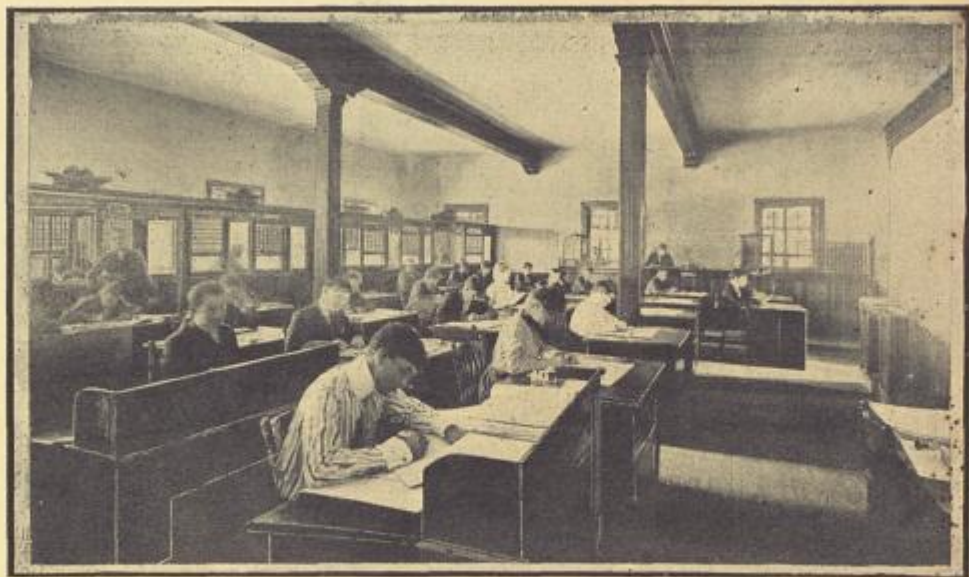
BOOKKEEPING DEPARTMENT. Business College of John B. Stetson University.