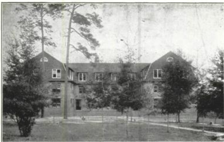
J. B. CONRAD HALL, STETSON UNIVERSITY.

The Stetson College of Law has the best library in the State of Florida, with the single exception of the law library of the State Supreme Court. The greater portion of the cost of starting this library was contributed by the Bar of Florida and the alumni of the College. The University is steadily adding to it.