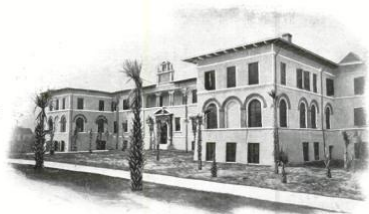
THE LAW SCHOOL, STETSON UNIVERSITY.

The apartments of the Stetson College of Law are on the third floor of this building. They include lecture and recitation rooms, library and reading rooms, a practice court room, a Kent Club or law debating society hall, and the Dean's offices.