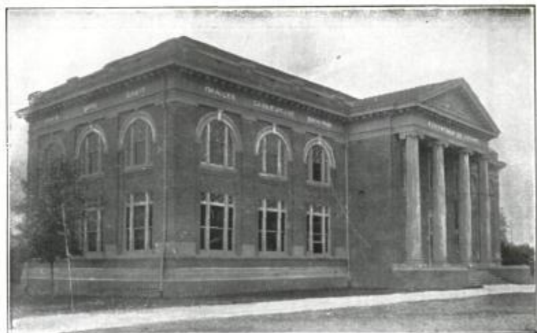
CARNEGIE LIBRARY, STETSON UNIVERSITY.

This splendid structure, 250 feet in length, is one of the most beautiful and complete buildings devoted to educational purposes in the entire South.