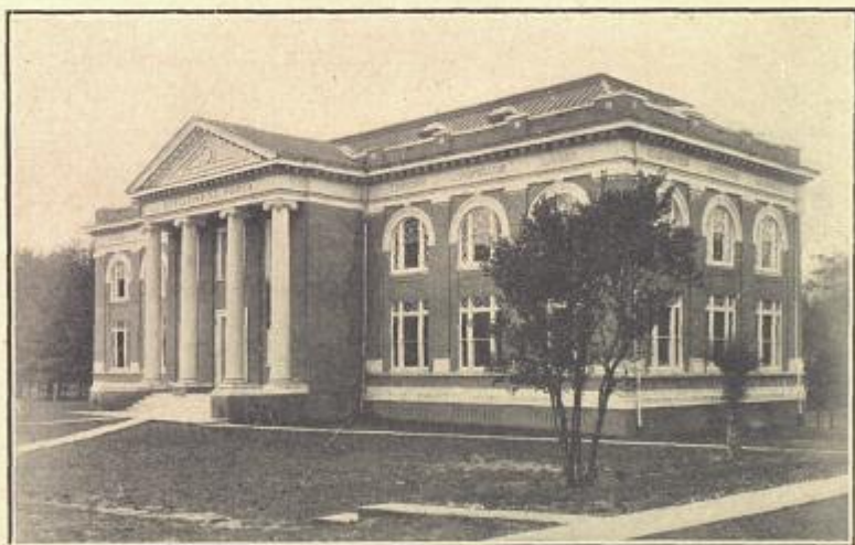
CARNEGIE LIBRARY, STETSON UNIVERSITY.

This library represents an investment in building, endowment and books, of more than $120,000.00. It contains more than 21,000 bound volumes of the best selected books, and an extensive collection of the best periodical literature. It is the United States Depository for the State of Florida. The students have the use of it besides the Law Library.