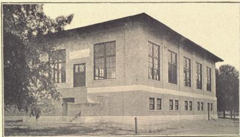
East view of Cummings Gymnasium, which is one of our most beautiful buildings.