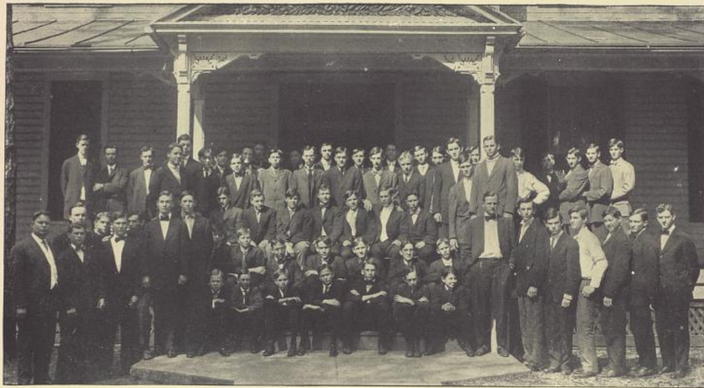
In front of the dormitory for younger boys at Stetson.