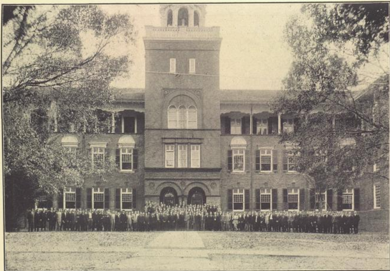
Some of the men students assembled in front of Elizabeth Hall. The tower is a replica of the tower in Old Independence Hall, Philadelphia.