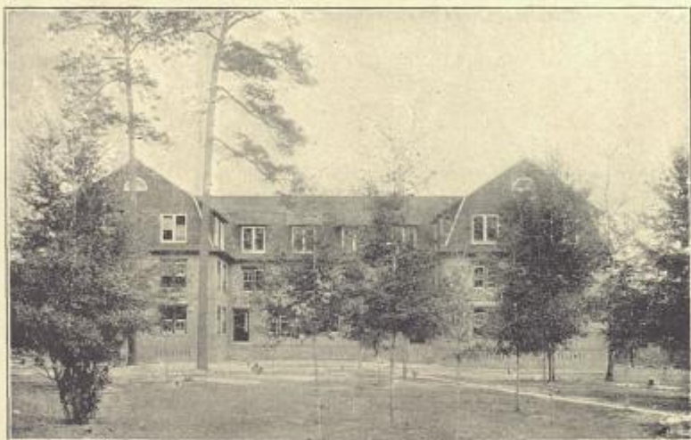
J. B. CONRAD HALL, STETSON UNIVERSITY.

The Stetson College of Law has the best library in the State of Florida, with the single exception of the law library of the State Supreme Court. The greater portion of the cost of starting this library was contributed by the Bar of Florida and the alumni of the College. The University is steadily adding to it. It now has over 3000 volumes.