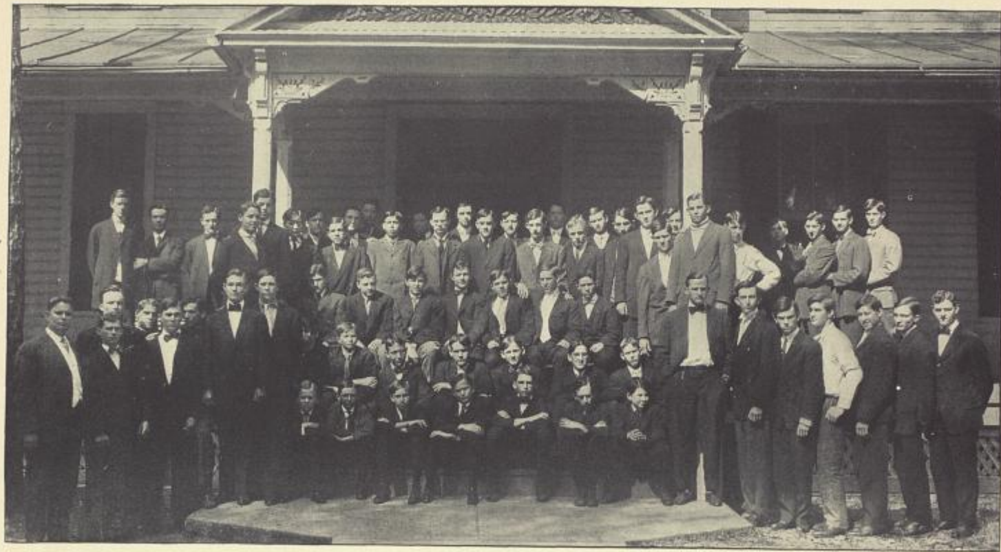
In front of the dormitory for younger boys at Stetson.