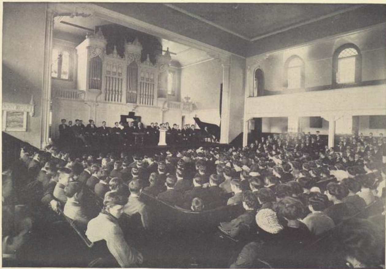
The daily morning Chapel Service. This room seats more than 900. Not all of the students are visible.