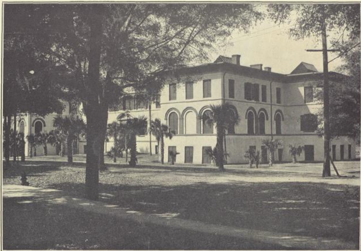
THE LAW SCHOOL, STETSON UNIVERSITY

The apartments of the Stetson College of Law are on the third floor of this building. They include lecture and recitation rooms, library and reading rooms, a practice court, a Kent Club or law debating society hall, and the Dean's offices.