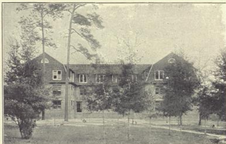
J. B. CONRAD HALL, STETSON UNIVERSITY

The Stetson College of Law has the best library in the State of Florida, with the single exception of the law library of the State Supreme Court. The greater portion of the cost of starting this library was contributed by the Bar of Florida and the alumni of the College. The University is steadily adding to it. It now has over 3000 volumes.