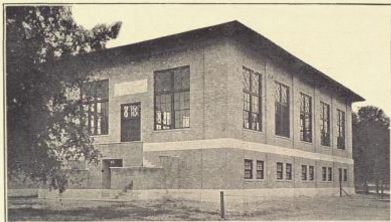
East view of Cummings Gymnasium, which is one of our most beautiful buildings.