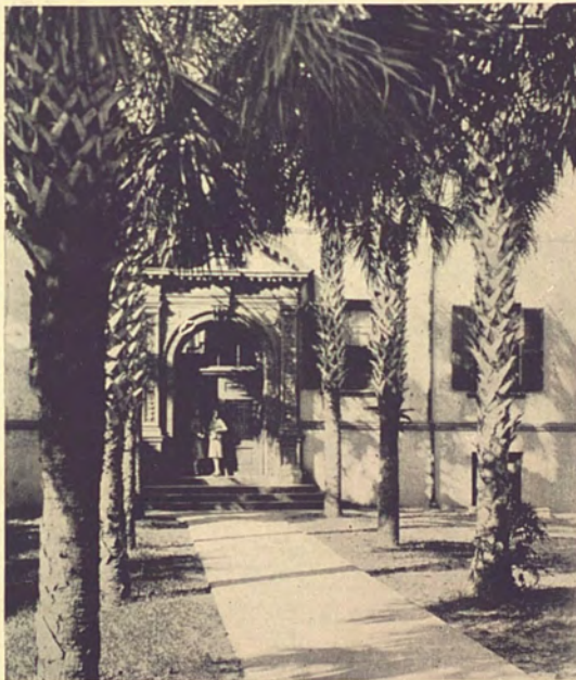
ENTRANCE TO STUDIOS

"Art reaches back into the babyhood of time, and is man's only lasting monument." —Wm. Morris Hunt.