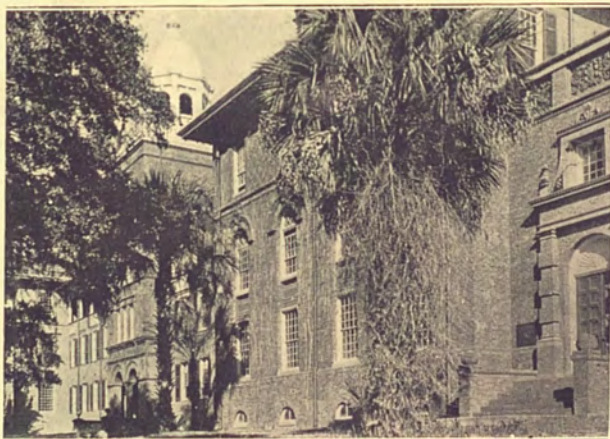
ENTRANCE TO ART GALLERY

— Department of The Interior, Bureau of Education, Washington, D. C.