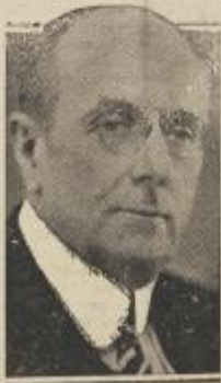
HOMER S. CUMMINGS