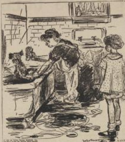
"Hey, Noon, the lady downstairs is still hollerin' up the dumbwaiter about her cellin' up is lookin'."