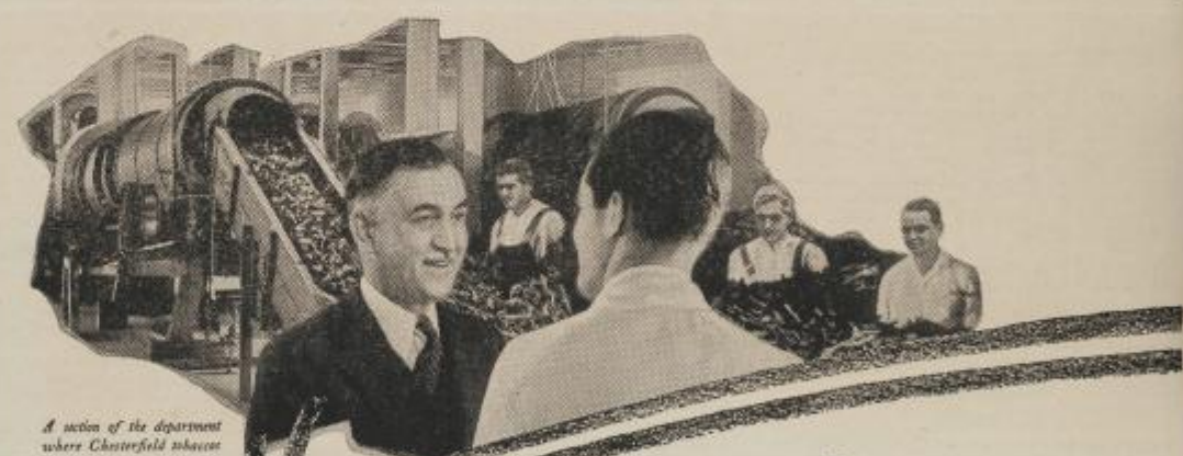
A section of the department where Chesterfield tobaccos are blended and cross-blended.

Just what is meant by cross-blending tobaccos . . . and how does it make a cigarette milder and taste better . . .