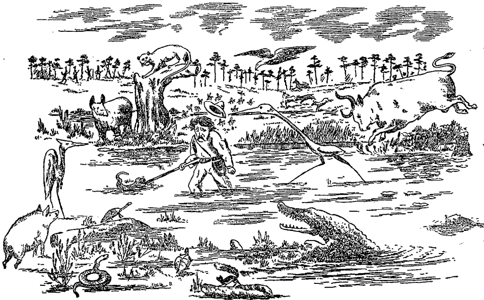
Map of saleable Lands on the Florida - Rail Road