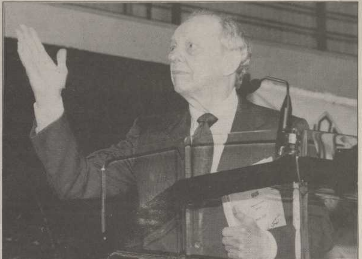
Actor Don Knotts, best known as Deputy Barney Fife on the Andy Griffith Show, was the featured speaker at the Night of Knights fund raising event and auction in the UCF Arena, recently. The event raised funds for the athletic department.