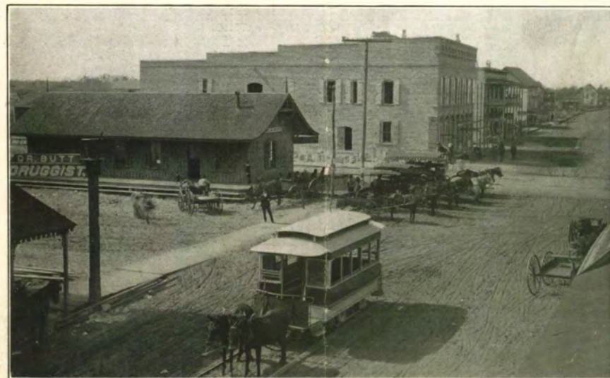
Orlando's First Passenger Station—1883