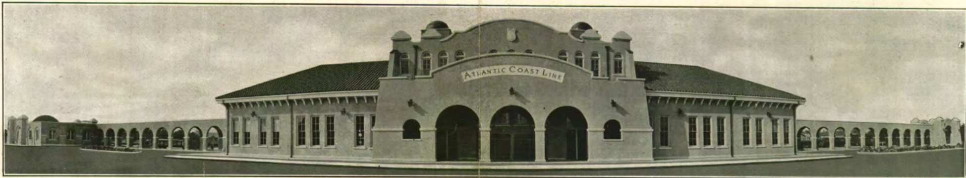
New Atlantic Coast Line Passenger Station, Orlando, Florida—1927