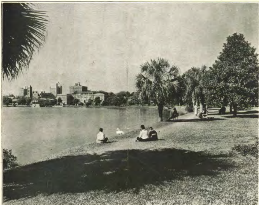
Orlando From Across Lake Eola