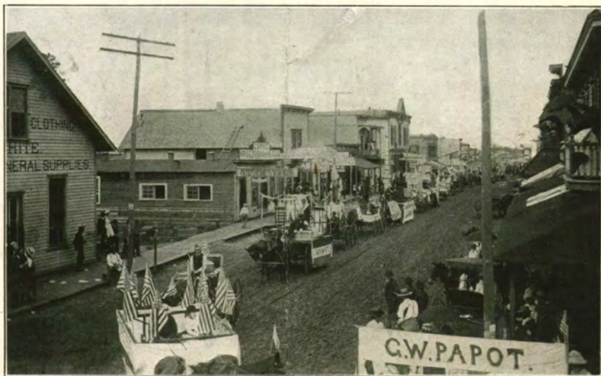
Orlando Paraded July 4, 1884