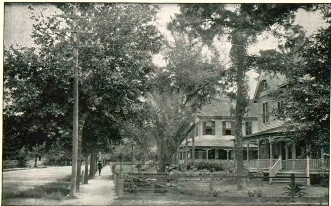
SCENE ON NORTH ORANGE AVENUE.