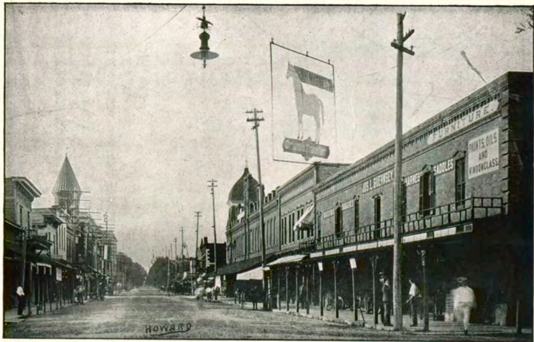
ORANGE AVENUE, LOOKING NORTH.