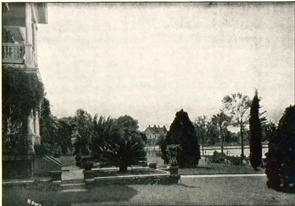
RESIDENCE, LAKE LUCERNE.