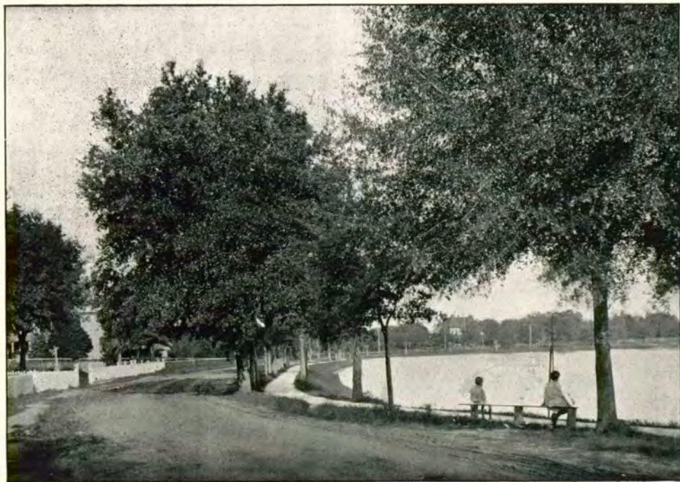
SCENE ON LAKE LUCERNE.