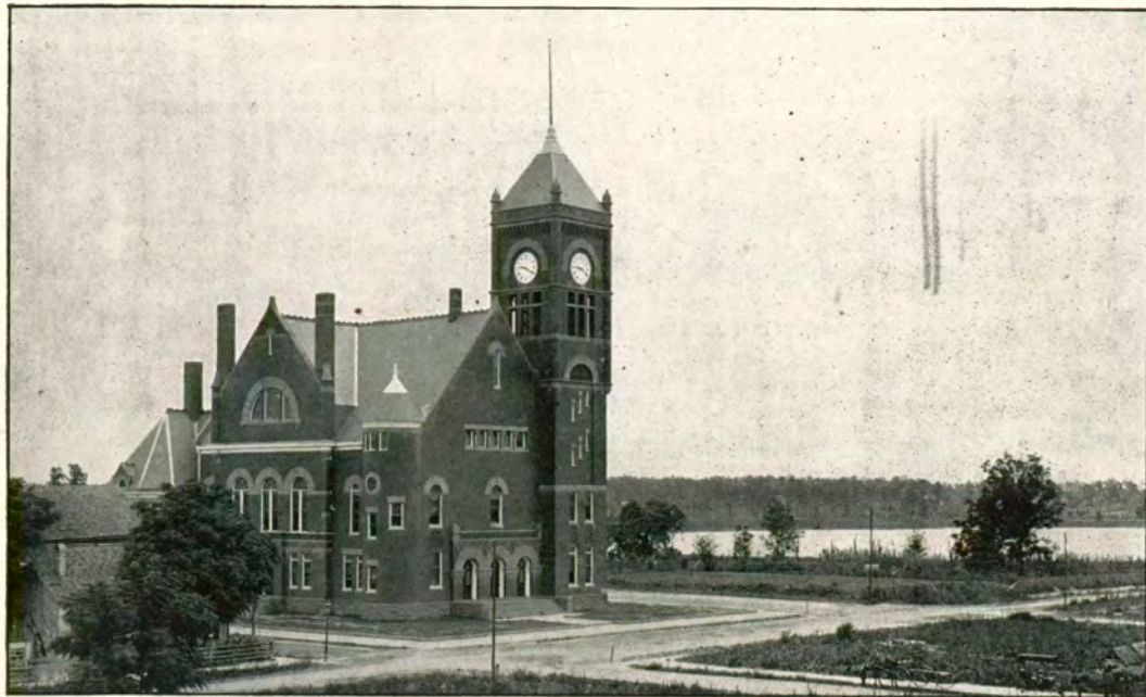
ORANGE COUNTY COURT HOUSE. LAKE BOLA IN THE DISTANCE