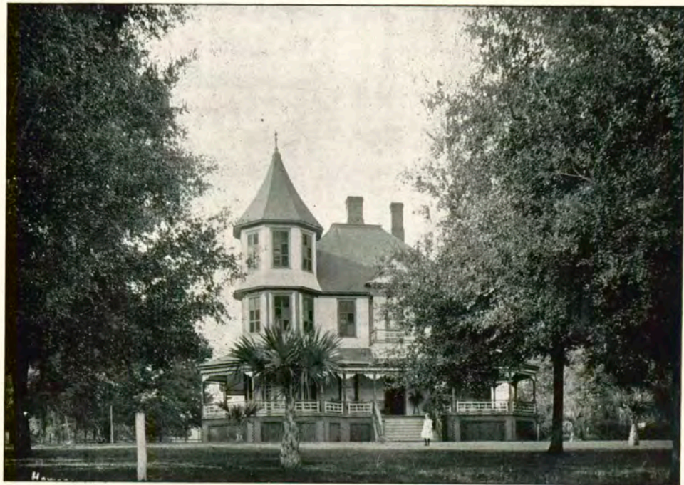
RESIDENCE ON LAKE LUCERNE.