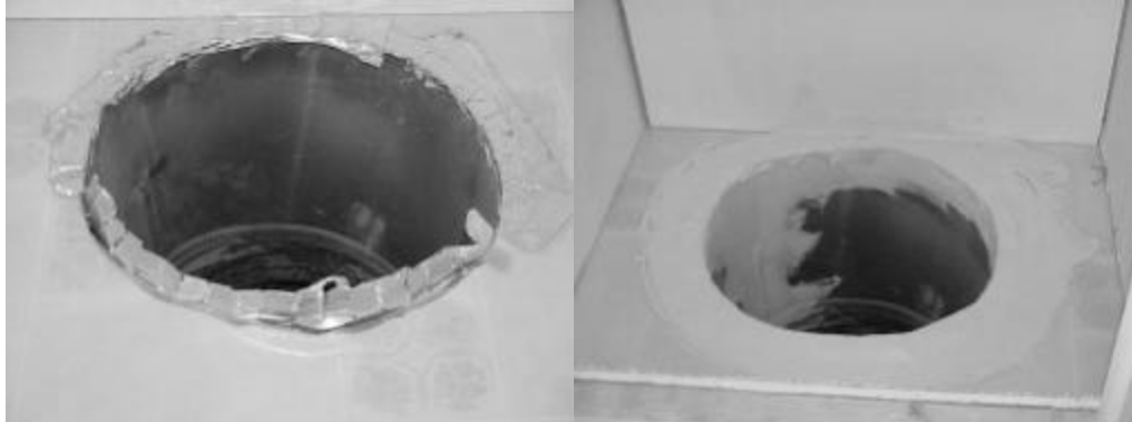
Figure 2 An unsealed duct (left), and a duct sealed with mesh and mastic (right)