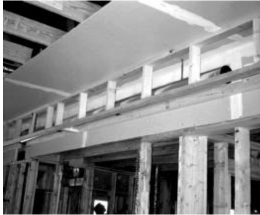
Figure 8 Chase along wall of open living area. Note chase sealing with drywall compound

The top of the chase should be uninterrupted by framing. Miscellaneous bracing that interrupts the upper air barrier creates additional cutting, fitting, and sealing work. In most cases, the air barrier will be made of an air-tight material (e.g. drywall, rigid insulation) sealed at the edges and seams, and the thermal barrier will be ceiling insulation installed over the top of the chase, plus the sides for fur-ups.