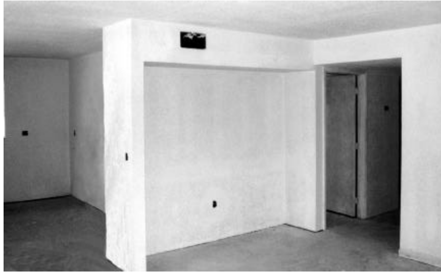
Figure 3 Interior duct chase, with supply register