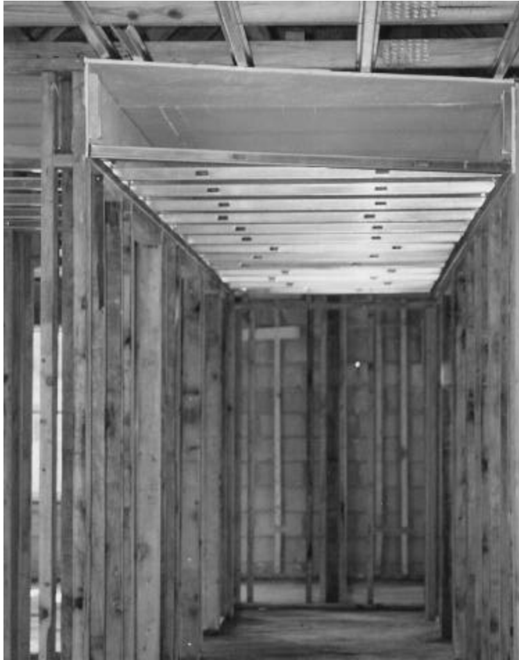
Figure 7 Chase under construction in ranch house hallway

To locate the chase in a specific design, start by examining the plan for an obvious path. The air handler can be located either centrally or at one end of the chase, but as the heart of the duct system, it must be inside the conditioned space. To avoid long run-out ducts, the chase should trace a path down the center of the house and go to all spaces to be served. Otherwise, small supply runs in unconditioned spaces or excessive chase construction will be required to reach distant rooms. Align the central chase with closets, cabinets, or transverse halls to achieve coverage of all rooms.