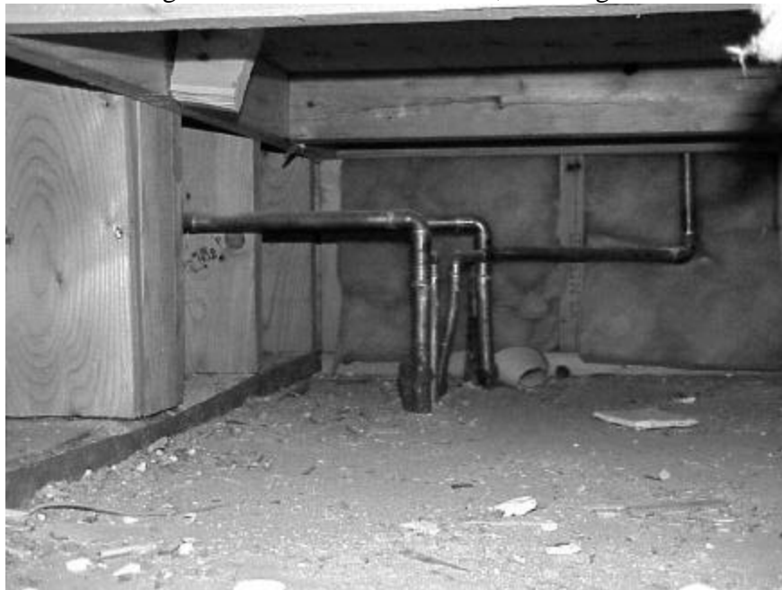
Figure 12 Conventional platform return. Rough framing connected to attic through walls of air handler closet, resulting in return leaks

Advisory notices to cable, security, and phone installers should be posted in conspicuous locations such as the panel box, attic access hatch, wiring service entrance, etc. Since these cannot clearly identify the location of the air boundary in the attic, the