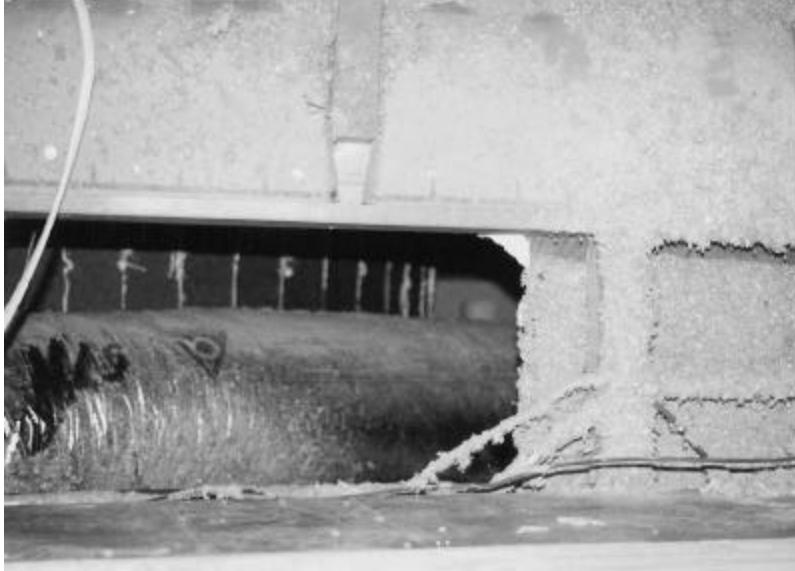
Figure 4 Fur-up chase compromised by plumbing and wiring

Fur-down chases. Chases built down into the conditioned space generally occupy the upper portion of hallways, run along walls, and/or cut across open living areas as architectural elements (Figure 5). The lowered ceiling height can be offset by widening the hallway and can be used to define living spaces in open floor plans. Most of the houses included in this field study featured fur-down chases.