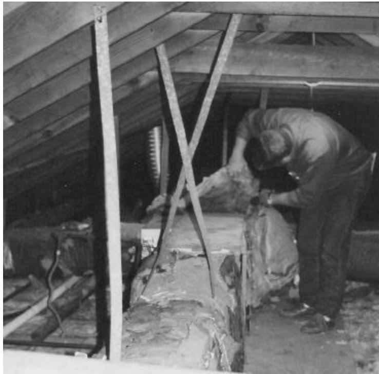
Figure 1 Leaky ducts in unconditioned spaces cause unbalanced air flow and can gain or lose heat sufficient to change the supply air temperature by 4 o to 5 o F