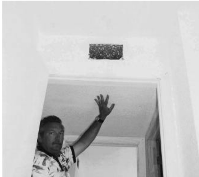
Figure 6 Chase in hallway, note 7'0" ceiling and door clearance

Integrating interior ducts into plans. In ranch style homes (homes with all bedrooms grouped together at one end of the house, also incorporating a main hallway), the chase runs the length of the hallway (flanked by bedrooms) and extends out into the main living area (Figure 7).