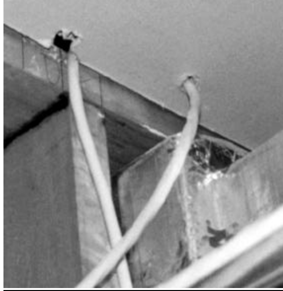
Figure 13 Holes for wiring, plumbing, cables, etc. need to be sealed with a code approved sealant

notices should advise the installer to seal any penetrations to drywall made from unconditioned spaces. Though this should be standard practice and is often required by code, virtually all services installed post-occupancy are never inspected.