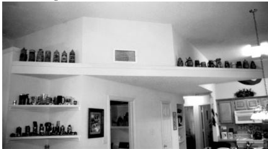
Figure 5 Chase used as an architectural detail

A standard definition for “conditioned space”. The “conditioned space” is defined by the location of the air barrier and thermal barrier. The air inside these barriers is cycled through the air handler and conditioned . To be in the conditioned space , the duct system must be isolated from all adjacent unconditioned spaces (including wall cavities) by a continuous air barrier and be within the thermal barrier of the house. The benefits, both thermal and air exchange, of interior duct systems will be severely diminished if not completely lost without these barriers.